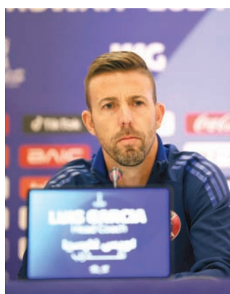
Qatar coach Luis Garcia and UAE coach Paulo Bento (below) address the media in Kuwait City.