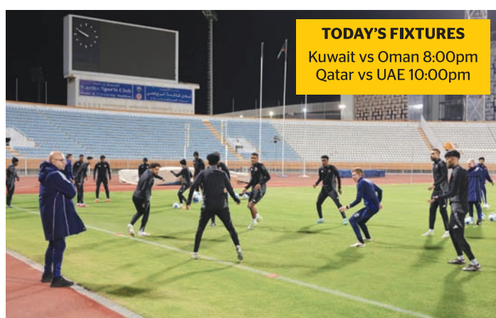
Qatar players during a training session in Kuwait City yesterday.