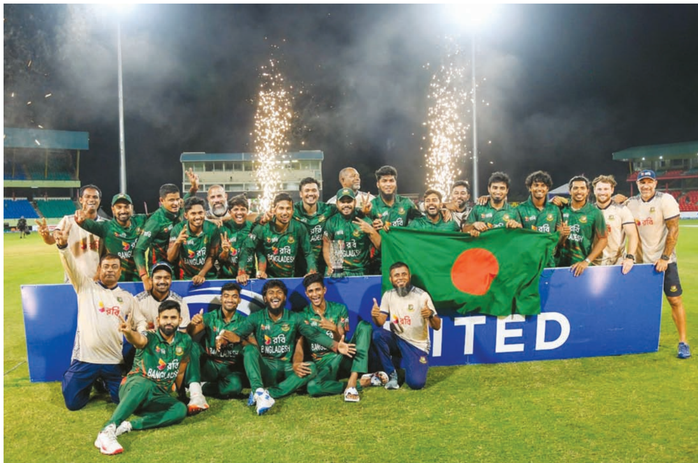
Bangladesh players and team officials celebrate their T20I series win over West Indies. Bangladesh won the three-match series 3-0.

Jaker Ali smashes blistering 72 to set up win for the visitors