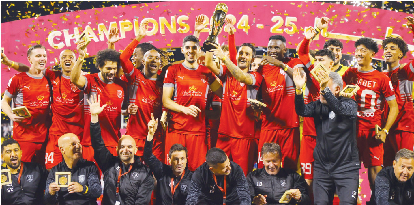
Al Duhail players and officials celebrate after winning the QSL Cup at the Suhaim Bin Hamad Stadium yesterday.