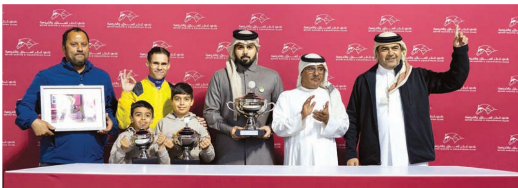
Connections of Jungle Mate celebrate after the three-year-old gelding won the Ras Laffan Cup yesterday.