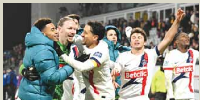
PSG players celebrate their victory over Lens in the French Cup round of 64 match at the Bollaert-Delelis Stadium in Lens.

France will now face PSG in the next round in mid-January, in what is a dream tie for the lower-league side. Elsewhere on Sunday, Marseille cruised to a 4-0 win away at Saint-Etienne in another all-top-flight tie. Saint-Etienne had Ibrahim Sissoko sent off before the midway point in the first half, and Marseille took full advantage as Mason Greenwood fired them ahead moments later with his 11th goal of the season. Adrien Rabiot made it 2-0 before the break and both Luis Henrique and Pierre-Emile Hojbjerg found the net in the second half. Marseille will be at home to Lille in a heavyweight tie in the last 32. Monaco were 4-1 winners way at minnows Union Saint-Jean in Toulouse, and will next go to Reims, who also won away at lower-league opposition on Sunday.