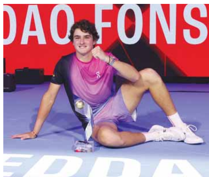
Brazil's Joao Fonseca celebrates with the trophy after winning the Next Gen ATP Finals in Jeddah.

"I look forward to playing with them. I hope I can compete in big matches at the Grand Slams. It's where I want to go."