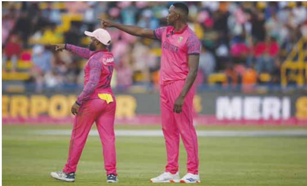
South Africa's Kagiso Rabada (right) and Temba Bavuma set the field during the third ODI against Pakistan at The Wanderers Stadium in Johannesburg on Sunday. Both players are expected to play key roles in South Africa's two-Test series against Pakistan starting on Thursday.

The tourists also arrived without coach Jason Gillespie, who dramatically quit this month and