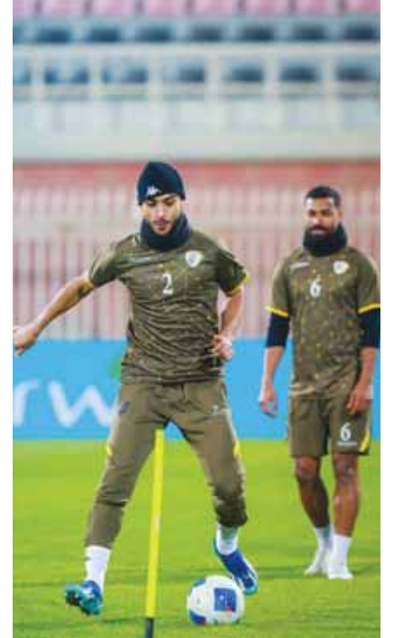
Oman players train yesterday, on the eve of their match against Qatar.