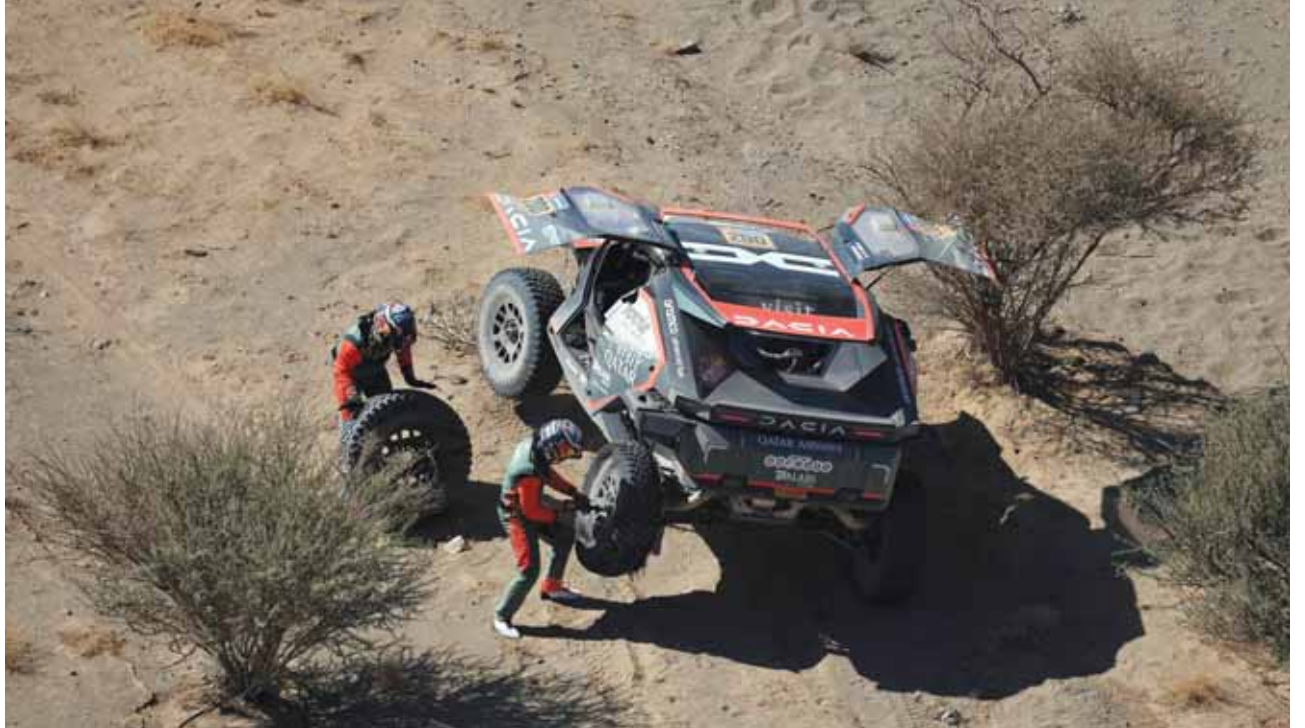
Qatari driver Nasser al-Attiyah and his co-driver Edouard Boulanger repair their car after a puncture during Stage 2B of the 47th Dakar Rally in Bisha, Saudi Arabia, yesterday.

"When opening, you didn't know if it was going to be a soft dune or a hard dune.