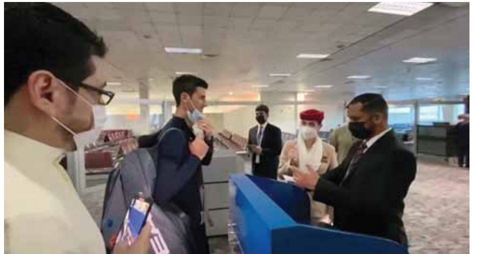
Serbian tennis player Novak Djokovic makes his way to the gate to board a flight to Belgrade at Dubai Airport, after the Australian Federal Court upheld a government decision to cancel his visa to play in the Australian Open, in Dubai, UAE, January 17, 2022.

Djokovic, who is ranked seventh in the world, will be on the hunt for a record 25th ma-