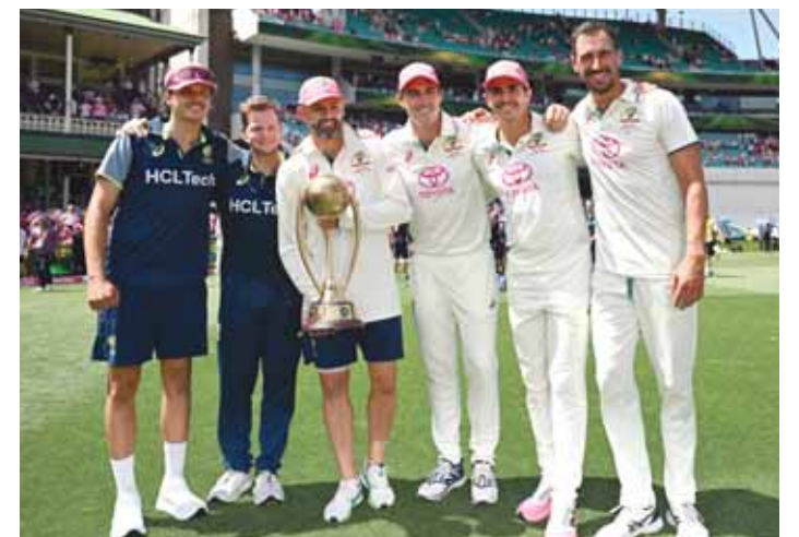
FROM LEFT: Australia's Sam Konstas, Steve Smith, Nathan Lyon, Pat Cummins, Sean Abbott and Mitchell Starc pose with the Border-Gavaskar Trophy at the Sydney Cricket Ground on Sunday.

"They must tell the players that Indian cricket comes first. It's either a full commitment to Indian cricket or other priorities."