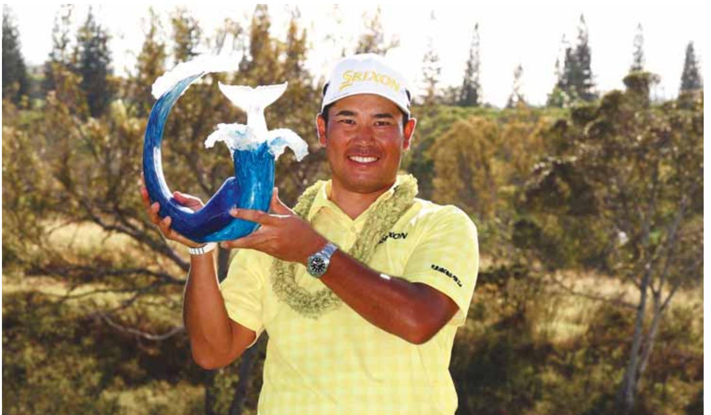
Hideki Matsuyama of Japan poses with the trophy after winning The Sentry 2025 at Plantation Course at Kapalua Golf Club in Kapalua, Hawaii.

"Obviously you need to shoot a lot of low scores to keep up here," Aberg said. "It's a great place to