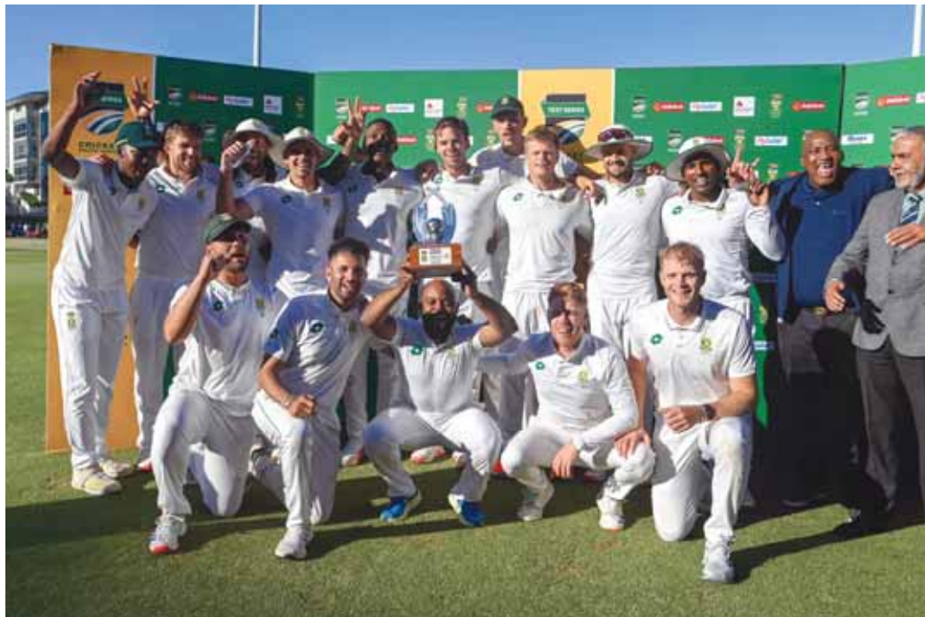
South Africa's Temba Bavuma (centre) holds up the trophy after winning the Test and the series against Pakistan at Newlands Stadium in Cape Town yesterday.

It is perfect preparation for their appearance in the World Test Championship final against