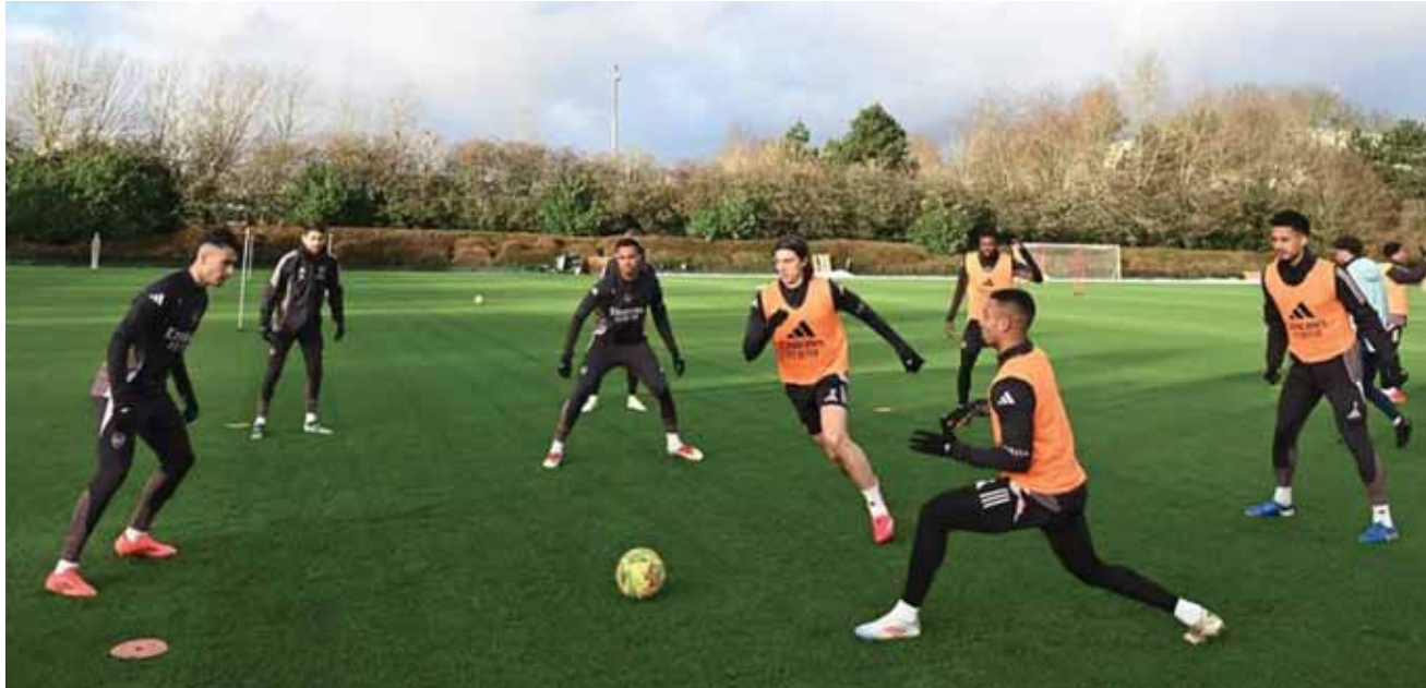
Arsenal players train in London yesterday, ahead of their League Cup match against Newcastle.

the January transfer window to replace their walking wounded, Arteta demurred, adding: "Whatever is in the market, we're very alert, but the priority is working with the players that we have at the moment. We have to sign players to really elevate and impact the team, otherwise just bringing in bodies doesn't help us."