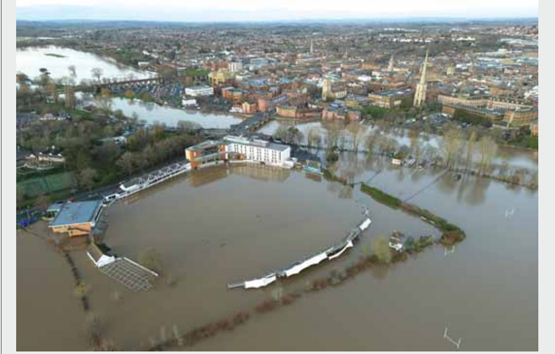
A drone view shows floodwater covering Worcestershire New Road cricket ground, the home of Worcestershire County Cricket Club, in Worcester, Britain.