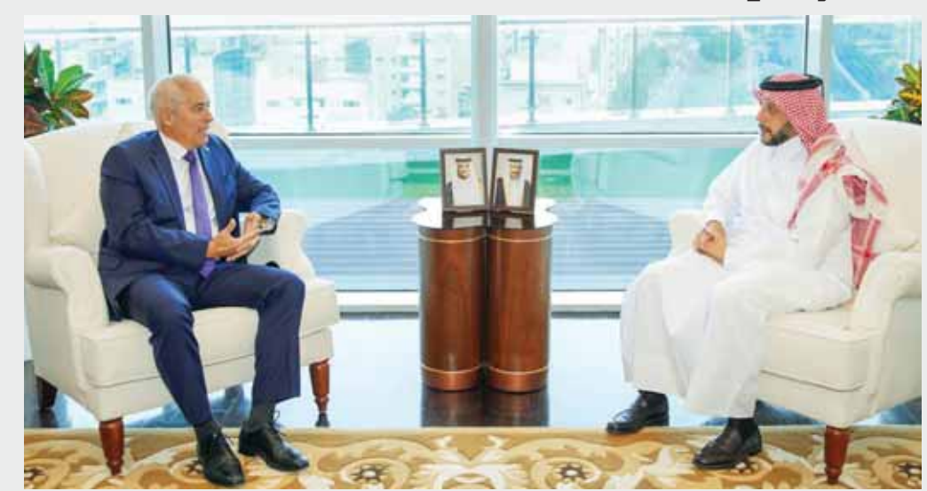
HE the Minister of Public Health Mansoor bin Ebrahim bin Saad al-Mahmoud has met with the visiting First Deputy Minister of Foreign Affairs of Cuba, Gerardo Penalver Portal. Talks during the meeting focused on bilateral relations and ways to boost them in the field of health. (QNA)