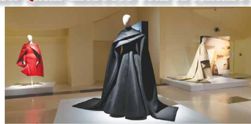
The QM noted that this exhibition offers a unique perspective on the intersection of traditional Arab design and modern couture.

The exhibition highlights the designer's meticulous techniques and innovative designs, elevating the couture dresses to monumental works of art that are placed in dialogue with Qatar's stunning architectural backdrop.