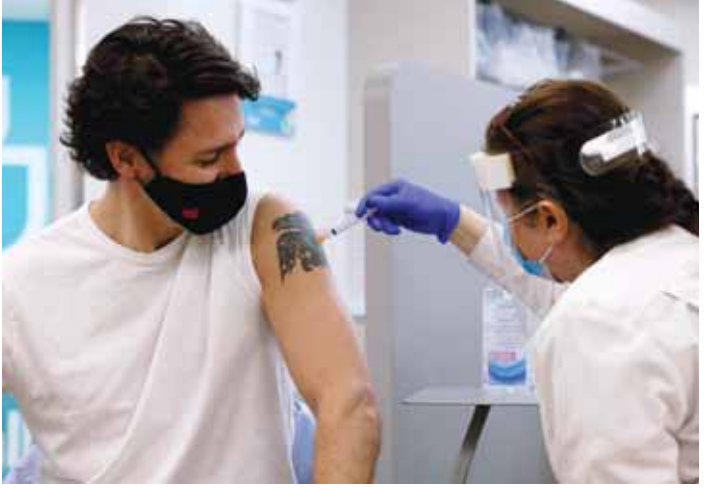
Canadian Prime Minister Justin Trudeau being inoculated with AstraZeneca's vaccine against coronavirus disease at a pharmacy in Ottawa, Ontario, on April 23, 2021.

The Canadian side, led by then-foreign minister Freeland,