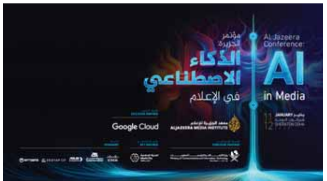
The conference to be held on January 11-12.