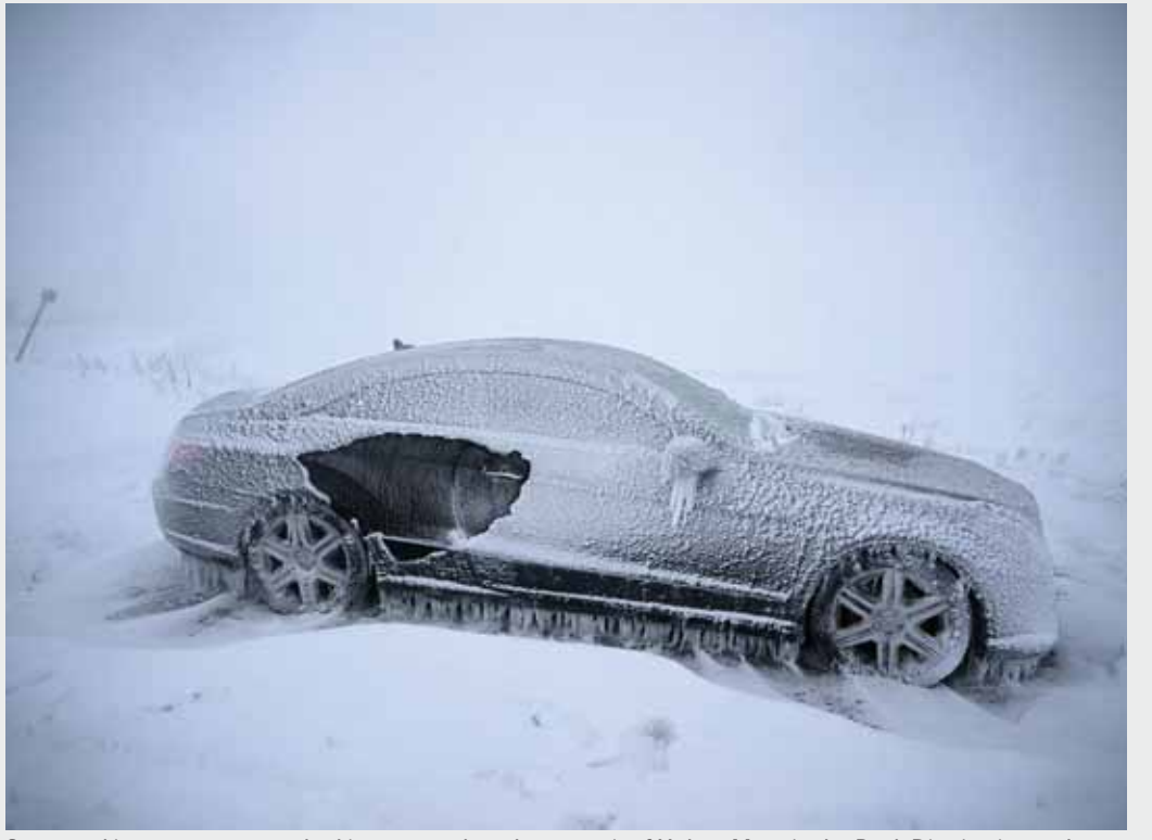
Snow and ice cover a car parked in a car park at the summit of Holme Moss in the Peak District, in northern England, after snow and rain continued to fall across parts of the United Kingdom.