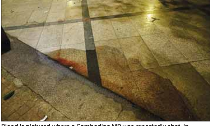
Blood is pictured where a Cambodian MP was reportedly shot, in Bangkok yesterday.

Scores of opposition politicians and activists were convicted and jailed during his time in power, with challengers forced to flee and