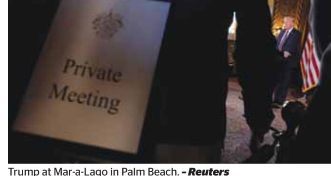
Trump at Mar-a-Lago in Palm Beach.

Asked whether he could assure the world that he would not use