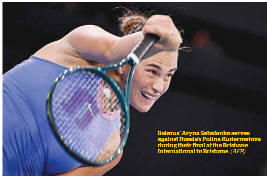
Belarus' Aryna Sabalenka serves against Russia's Polina Kudermetova during their final at the Brisbane International in Brisbane.

old said. "You know, the volume at the beginning of the tournament especially has been pretty big. But honestly, it's all good."