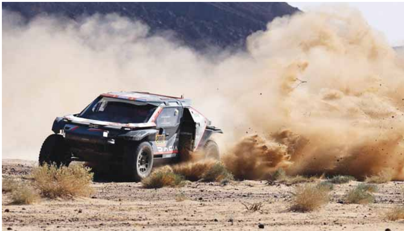
Qatari driver Nasser al-Attiyah and his navigator France's Edouard Boulanger in action on their Dacia Sandriker during stage 3 of the 47th Dakar Rally between Bisha and Al Henakiyah in Saudi Arabia yesterday.