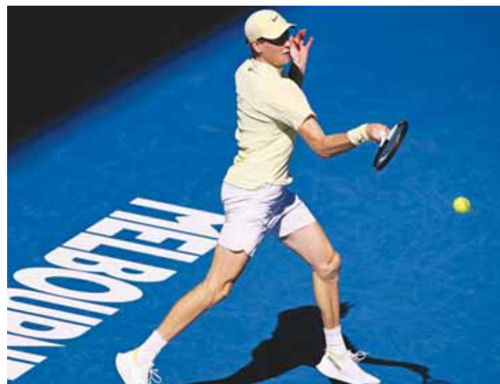
Jannik Sinner of Italy hits a return during a practice match against Australia's Alexei Popyrin yesterday, ahead of the Australian Open in Melbourne.

for me on this court and off the court," he added.