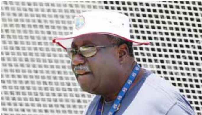
Clive Lloyd...former World Cup winning captain of West Indies.

Former India coach Ravi Shastri is a vocal supporter of the two-tier concept, which he believes can help test cricket survive against T20.