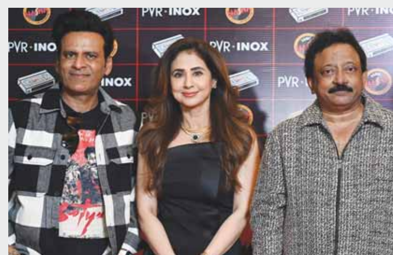
Bollywood actors Manoj Bajpayee (left), Urmila Matondkar and Indian film director Ram Gopal Varma pose for photographs during the re-release of their Hindi-language film Satya in Mumbai.