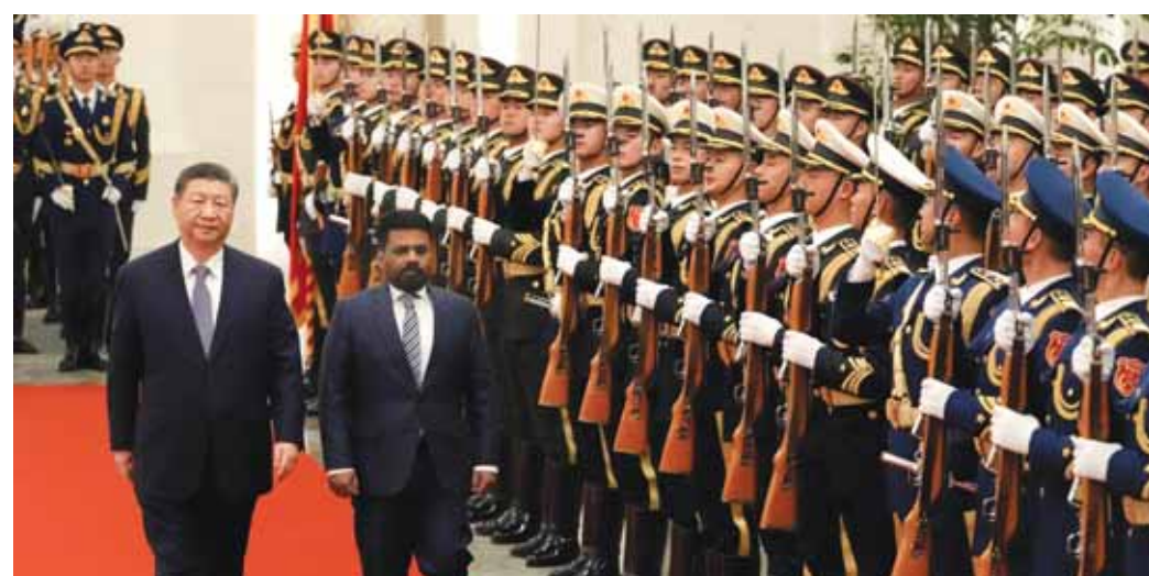
Chinese President Xi Jinping, left, walks with Sri Lankan President Anura Kumara Dissanayake during arrival ceremonies at the Great Hall of the People in Beijing, China, yesterday.

In a parallel probe, the Constitutional Court on Tuesday launched a trial to rule on parliament's impeachment of Yoon. If the court endorses the impeachment, Yoon will finally lose the presidency and fresh elections will have to be held within 60 days. The trial was adjourned on Tuesday after only a very brief hearing as Yoon declined to attend, but proceedings could last for months. South Korea's opposition Democratic Party celebrated Yoon's detention, with a top official calling it "the first step" to restoring constitutional and legal order after weeks of turmoil. The country's parliament speaker echoed those sentiments. "We should concentrate our efforts on stabilising state affairs and restoring people's livelihoods," Woo Won-shik said.