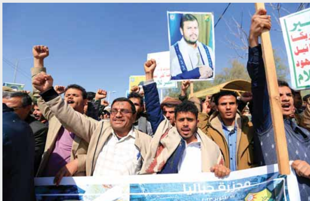
Yemeni university students and staff shout anti-Israel slogans as they hold up placards and portraits of the leader of the Houthi movement, Abdel Malek al-Huthi, during a protest in Sanaa to denounce strikes on Yemen and Israel's bombardment of Gaza, yesterday.