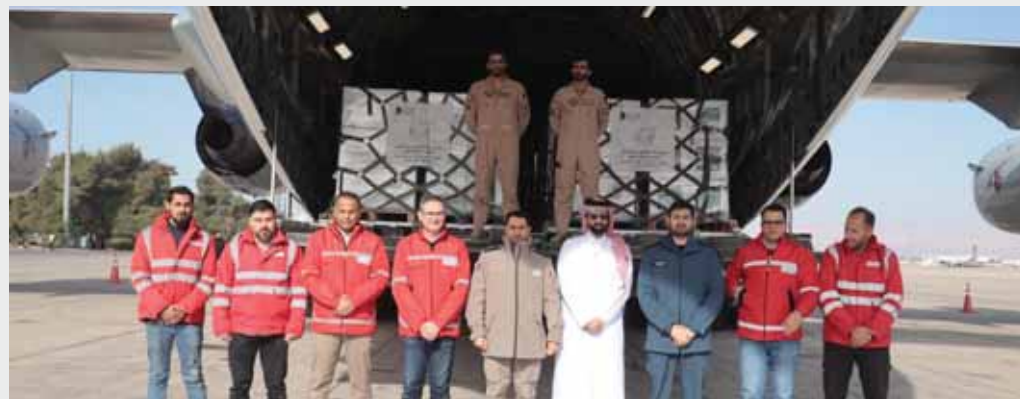
A Qatar Armed Forces plane landed at Damascus International Airport yesterday, carrying humanitarian aid including 32 tonnes of food, provided by the Qatar Fund for Development. This aid comes as a continuation of the airlift operated by Qatar to provide relief to the brotherly people in Syria and to contribute to addressing their humanitarian conditions. This is the sixth Qatari plane to land at Damascus International Airport, and the 11th within the Qatari airlift, which is a testament of the state's keenness to provide full support for the brothers in Syria.