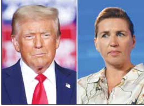
US President-elect Donald Trump (left) and Danish Prime Minister Mette Frederiksen.