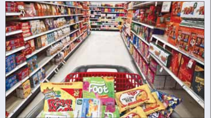
SPOTLIGHT: Bazoorka Ring Pop Lollipops, Del Monte Fruit Cup Snacks, Starburst Fruit By The Foot snacks, Double Bubble Bubble gum, Vigo Saffron Yellow Rice, and Baby Bottle Pop candy, all products that use Red Dye #3, can be seen in this illustration.

However, the additive continued to be used in foods, largely