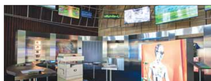
The exhibition questions the opportunities and challenges AI presents in contemporary life and how these relate to journalism.

"It allows us to explore the intricate relationship between human creativity and artificial intelligence (AI), a pressing topic in today's rapidly evolving media landscape. As we continue to create spaces for critical dialogue and community engagement, this exhibition is a prime example of how art and innovation can inspire exploration and challenge us to reflect on the evolving role of artificial intelligence in shaping the media landscape."