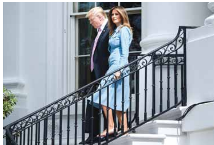
US President Donald Trump and US first lady Melania Trump arrive during the White House Easter Egg Roll on the South Lawn of the White House on April 22, 2019 in Washington, DC. They are set for a return, come January 20.

Voters fear immigration? In 2016, Trump led chants of "Build the wall!" without an effective plan for doing so, let alone showing how a wall on the US border