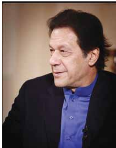
NO DEAL: The former PM has so far refused a deal for his freedom.

ity court" is set to announce the verdict and sentence in the welfare foundation case on Friday, two days after government envoys are scheduled to meet leaders from Khan's Pakistan Tehreek-e-Insaf (PTI) party to ease tensions.