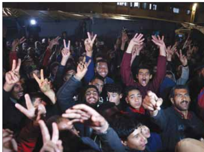
People celebrate along a street in Khan Younis in the southern Gaza Strip yesterday.