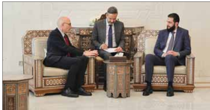
UN High Commissioner for Human Rights Volker Turk meets with Syria's de facto leader Ahmed al-Sharaa, in Damascus, yesterday.

Since rebels seized Damascus last month, the new authorities have sought to reassure Syrians and the international community