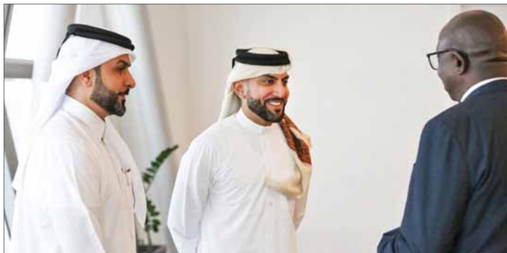
In a united effort to address human trafficking in sports, the International Organisation for Migration (IOM) Qatar, Mission 89, and Generation Amazing Foundation (GA) hosted an impactful roundtable discussion.

He noted that the 2025 edition of the festival will be the largest and most expansive, taking place across three iconic locations: the Sealine dunes, Hotel Park during the Doha Marathon by Ooredoo, and culminating at the historic Old Doha Port.