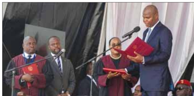
Daniel Chapo (second right) takes oath of office to be sworn in as the President of Mozambique during his inauguration at Independence Square in Maputo, yesterday.

to comment on the unrest, telling AFP: "We still have nothing to say about today's events." As he was sworn in, Chapo vowed "to devote all my energies to defending, promoting and consolidating national unity, human rights, democracy and the well-being of the Mozambican people".