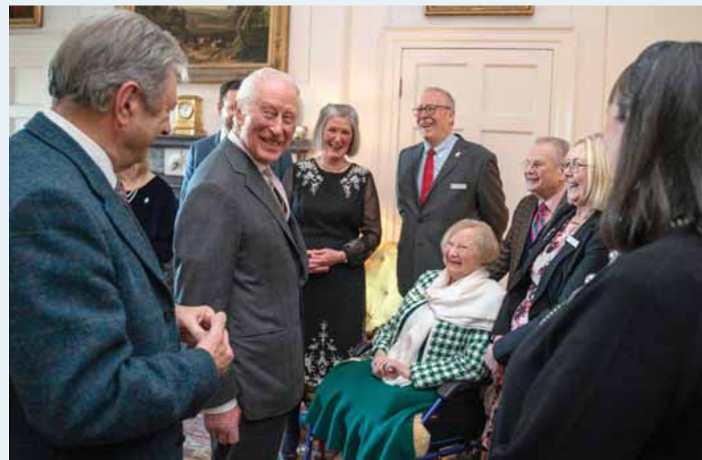
Britain's King Charles III reacts alongside King's Foundation ambassador Alan Titchmarsh during a reception with community representatives, students, alumni and ambassadors to celebrate the launch of The King's Foundation 35th anniversary year, at Dumfries House in Dumfries, south west Scotland. The awards celebrate the work of students, teachers, alumni and partners who have contributed to the work of the King's Foundation across a range of sectors.