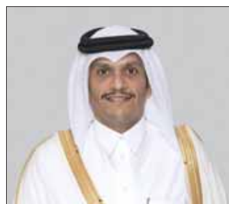
HE Sheikh Mohammed bin Abdulrahman bin Jassim al-Thani

HE the Prime Minister and Minister of Foreign Affairs Sheikh Mohammed bin Abdulrahman bin Jassim al-Thani announced that the joint mediation efforts of Qatar, Egypt and the US secured a Gaza ceasefire and prisoner swap deal between the Palestinian Islamic Resistance Movement (Hamas) and Israel.