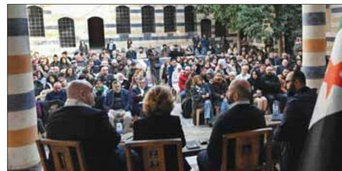
Representatives of Syrian civil society brainstorm strategies to ensure their country does not return to authoritarianism, in a scene unimaginable under president Bashar al-Assad's rule, in the courtyard of a traditional house in Old Damascus.

"We stressed the essential role that civil society needs to play in the political transition," said the director of a coalition of dozens of non-governmental groups called Madaniya.