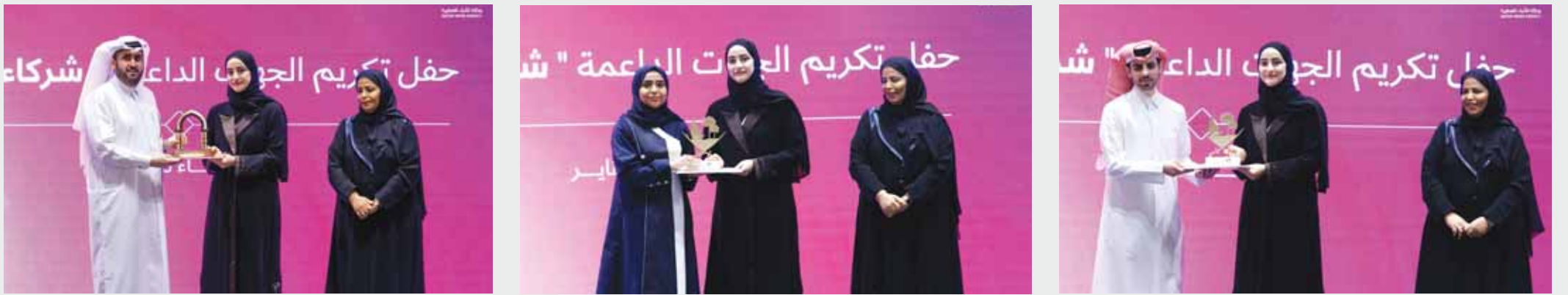
The Ministry of Labour honoured the "Partners in Success" who have supported its efforts to enhance the work environment in Qatar.