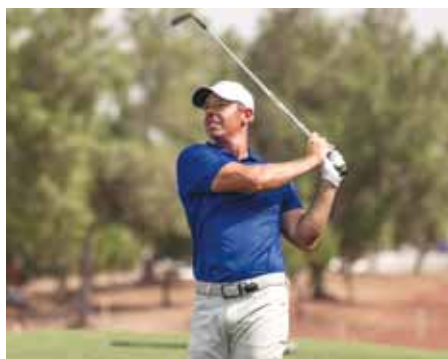
Dubai, open the season and have success, is a really strong start to the season. Obviously, that's the plan again this year." McIlroy was vocal about his opposition to LIV Golf, but the two European Ryder Cup stars have remained good friends through everything.

"The last couple of years, to come here to