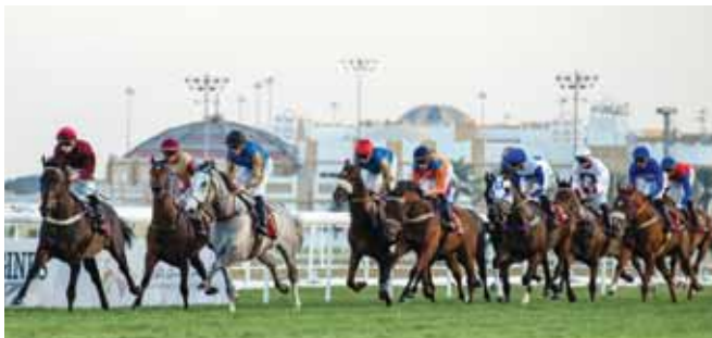
Ten thrilling races to be held on HE Sheikh Joaan Bin Hamad Al-Thani Rifle Day on January 18.

The first two races in the card will carry a prize of $30,000 each. The opener will see promising maidens and debutants taking on each other to open their records in the 1,750m Local Purebred Arabian Premium Maiden Plate. The following race, the Local Purebred Arabian Novice Cup, will be run over 1,400m.