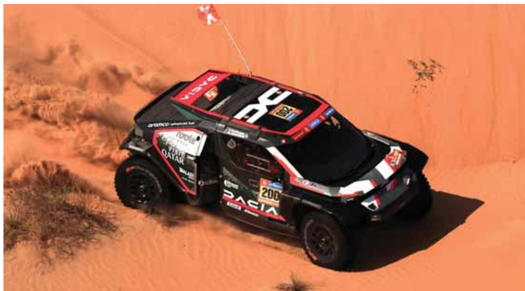
Qatar's Nasser al-Attiyah and French co-driver Edouard Boulanger compete in stage 10 of the Dakar Rally, between Haradh and Shubaytah, Saudi Arabia, yesterday.

"It's been a tough rally for us from the beginning," said Roma, a two-time Dakar winner (2004 on a motorbike, 2014 in the car category). "We tried to have a clean day. This morning we were so fast.