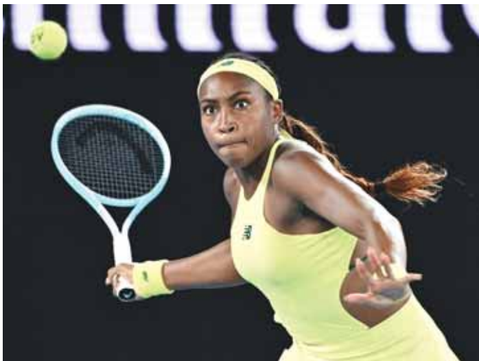
5-3 on her maiden appearance on Rod Laver Arena. She double-faulted twice to al-

Big-hitting Burrage collapsed when serving for the second set at