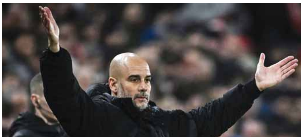
Manchester City's Spanish manager Pep Guardiola reacts during the English Premier League match against Brentford at the Gtech Community Stadium in London.

"It's a learning curve and it's just about how you get back to your best, not just me, but the team as well. And how we come back from this," Foden said.