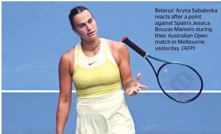
Belarus' Aryna Sabalenka reacts after a point against Spain's Jessica Bouzas Maneiro during their Australian Open match in Melbourne yesterday.

The Belarusian trailed Jessica Bouzas Maneiro 4-1 in the second set but battled