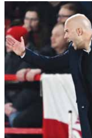
Liverpool manager Arne Slot reacts during Premier League match against Nottingham Forest in Nottingham.

They were also both English champions during that period and, while Forest are unlikely to ever emulate the Brian Clough era, this tenacious display indicated a title challenge is not beyond them.