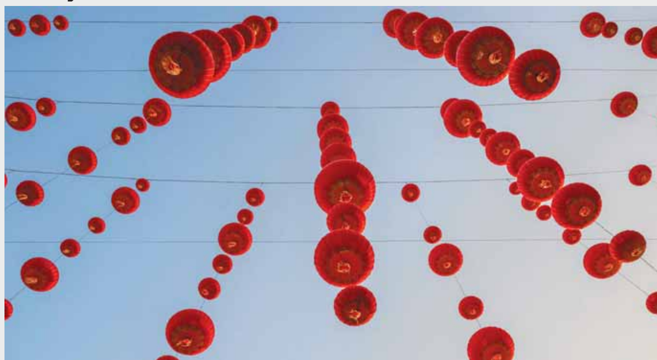
Traditional red lanterns marking the forthcoming Lunar New Year of the Snake are hung outside the Peninsula Hotel in Kowloon, Hong Kong.