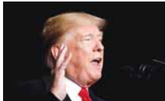
Trump has repeatedly expressed his desire to save TikTok.

It was not immediately clear if Trump has the authority to do so given the legal divestiture