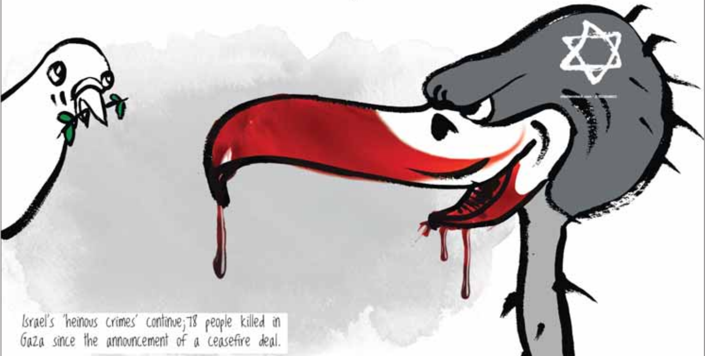
Israel's 'heinous crimes' continue; 78 people killed in Gaza since the announcement of a ceasefire deal.

"Ceasefire on Sunday, huh? Just enough time for a bloody feast"