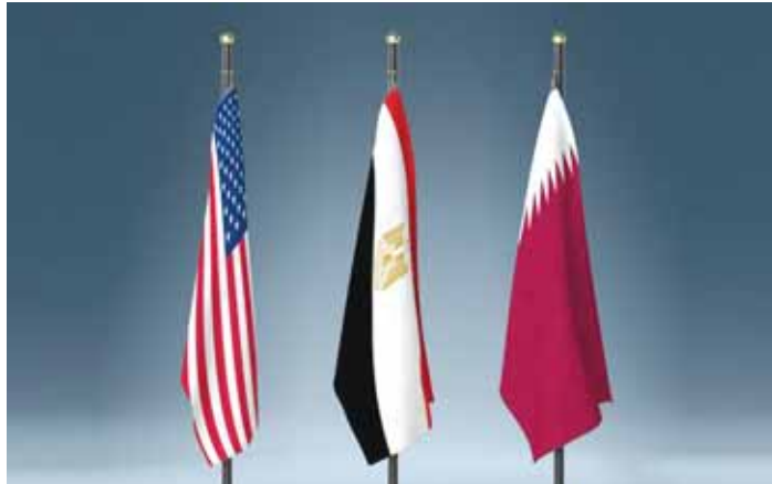
ping the fighting and bringing humanitarian aid into the Gaza Strip to end the starvation policy used by Israeli entity in addition to its prevention of food, medicine, and fuel and the siege of the Palestinian people, pointing out in this regard to the entity's targeting, during the

For his part, a member of the Egyptian Council for Foreign Affairs ambassador Rakha Ahmad Hassan affirmed in a statement to QNA that the ceasefire agreement came as a result of intensive efforts since last year made by the State of Qatar and the Arab Republic of Egypt, in co-operation with the US, indicating that these efforts did not stop in light of the keenness of the State of Qatar and Egypt on the necessity of stop-