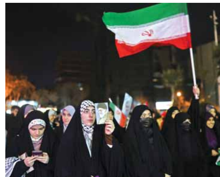
Iranian women celebrate following the news of a ceasefire between Hamas and Israel, in Tehran, Iran.

affected by the ongoing crisis. Qatar's efforts are a testament to its significant role as a global peacebuilder and its solidarity with the Palestinian people." Pakistan remains committed to supporting peace in the region and continues to stand with the people of Palestine in their just struggle for self-determination. We deeply value Qatar's continued contributions to this noble cause and believe that such diplomatic efforts set a precedent for resolving conflicts worldwide. As the ambassador of Pakistan to Qatar, I take this opportunity to reaffirm the strong bonds of friendship and co-operation between our two nations, bound by shared values and mutual aspirations for a peaceful and prosperous future. Once again, Pakistan appreciate and commends Qatar for its exemplary leadership and prays for lasting peace in Gaza and the wider region.