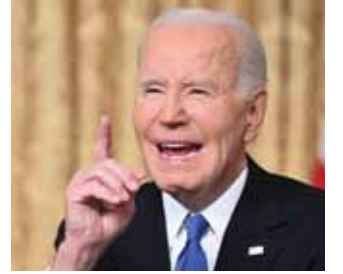
Biden: The free press is crumbling.

President Joe Biden said an oligarchy is forming in the US that threatens democracy, issuing the bleak warning on Wednesday in his final Oval Office speech as he prepares to hand over power to Donald Trump next week.