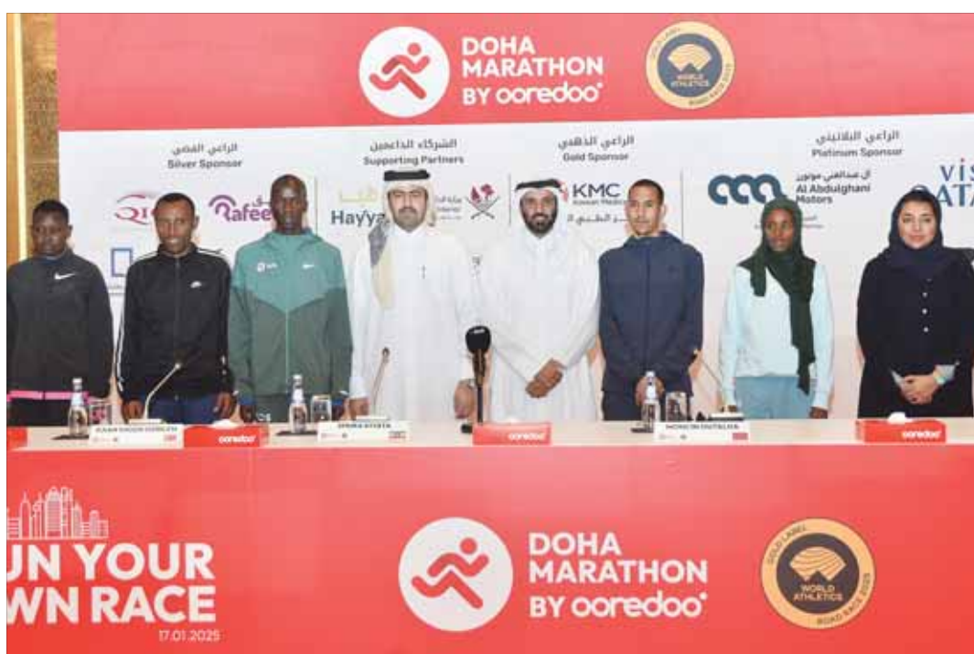
Ooredoo officials join some of the world's top athletes in the world of long-distance running during the Elite Press Conference hosted by Ooredoo Qatar yesterday.