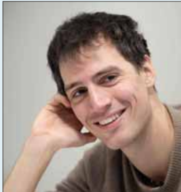
French founder of artificial intelligence startup Mistral AI, Arthur Mensch, smiles during an interview at the Mistral headquarters in Paris.

This "allows our customers to deploy solutions onto their infrastructure with significantly improved data governance compared with our US competitors," Mensch said.