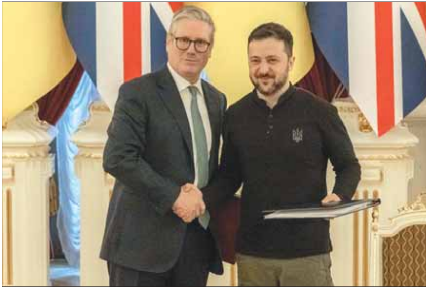
Ukraine's President Volodymyr Zelensky (right) shakes hands with British Prime Minister Keir Starmer after signing the agreement during the latter's visit to Kyiv.

Starmer said he would "work with all of our allies" to ensure any settlement was "robust enough to guarantee Ukraine's