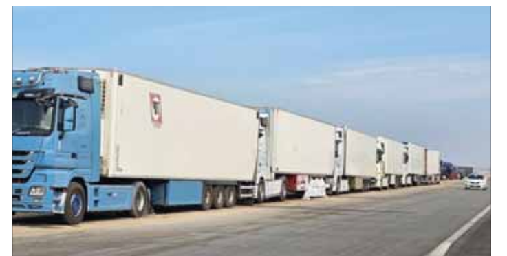
Trucks carrying aid line up near the Rafah border, waiting to cross into the Gaza Strip, following the announcement of a ceasefire agreement between Israel and Hamas, in Al Arish, Egypt, yesterday.

It paves the way for a surge in humanitarian aid for Gaza, where the majority of the population has been displaced, facing hunger, sickness and cold. Rows of aid trucks were lined up in the Egyptian border town of Al Arish waiting to cross into Gaza, once the border is reopened.