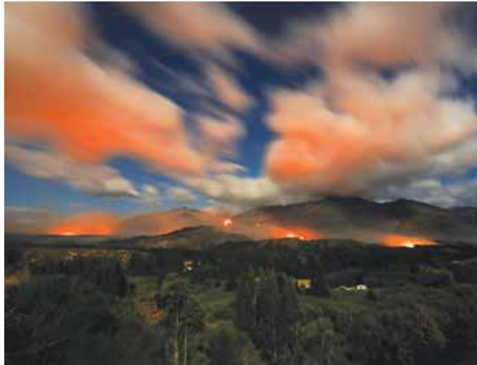
Flames and smoke rise from a wildfire in Epuyen, in the Patagonian region of Chubut, Argentina.

Three water-bombing aircraft and hundreds of firefighters and volunteers have been dispatched