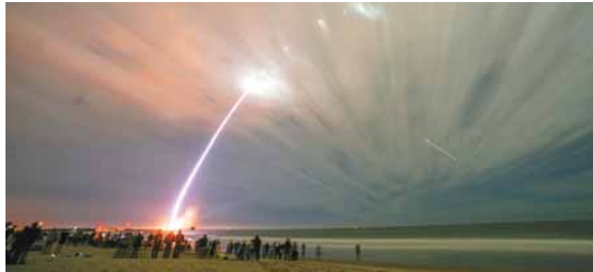
The Blue Origin New Glenn rocket lifts off on its inaugural launch at the Cape Canaveral Space Force Station in Cape Canaveral, Florida.

Secured inside New Glenn’s payload bay for the mission was the first prototype of Blue Origin’s Blue Ring vehicle, a manoeuvrable spacecraft the company plans to sell to the Pentagon and commercial customers for national security and satellite servicing missions.