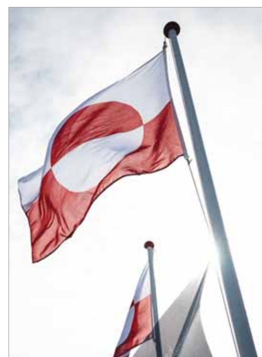
Greenland's flag flutters at the Inussivik hall in Nuuk, Greenland.

A 2018 study published by the Philosophical Transactions of the Royal Society B concluded that many human populations are undergoing an "extinction of experience," as destruction of habitats and concentration in urban areas makes interactions with wildlife more rare. - Thomson Reuters Foundation