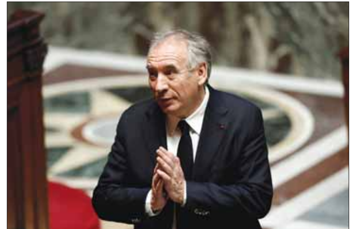
French Prime Minister Francois Bayrou reacts during a debate on a motion of no-confidence against the French government, tabled by members of parliament of La France Insoumise parliamentary group and joined by the Communists and the Les Ecologistes - EELV, at the National Assembly in Paris yesterday.

Tanguy warned, however, that the RN might still come for Bayrou over his budget for 2025 which