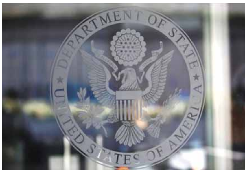
On his campaign website Donald Trump laid out how, in 10 steps, he would "shatter Deep State" and "fire rogue bureaucrats and career politicians"

In response to a request for comment, a spokesperson for Trump's transition team said: "It is entirely appropriate for the transition to seek officials who share President Trump's vision for putting out