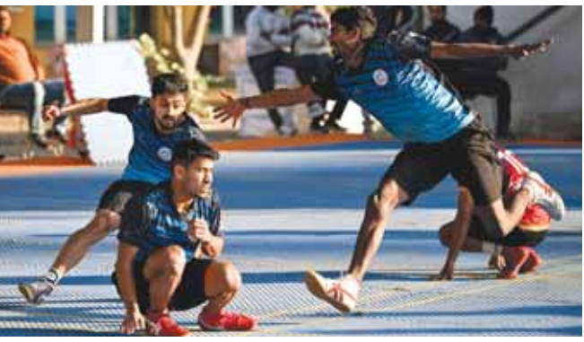
Members of India's men's kho kho team take part in the World Cup selection trials in New Delhi on January 8.

chase at a time and attacking players can only move in one direction around the court, forcing them to tag in teammates crouched on the centre line to take over pursuit. The match is won by whichever team can gain the most points, primarily by tagging defenders faster than the opposing team.