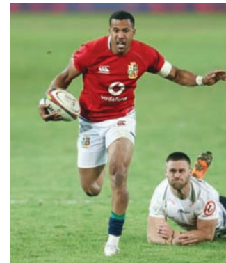
Borthwick congratulated Watson on a successful professional career.

"I was fortunate to have coached Anthony both at Leicester Tigers and England. He is a humble, hard-working professional man who is universally liked and admired in the game," Borthwick said.