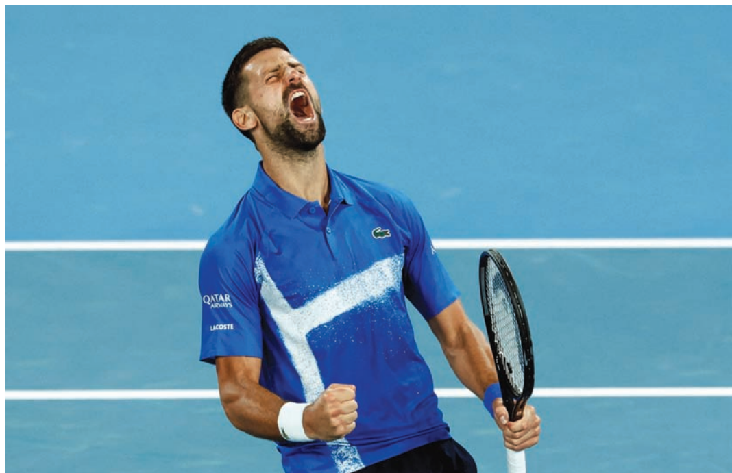
Serbia's Novak Djokovic celebrates winning his third-round match against Czech Republic's Tomas Machac at the Australian Open yesterday.