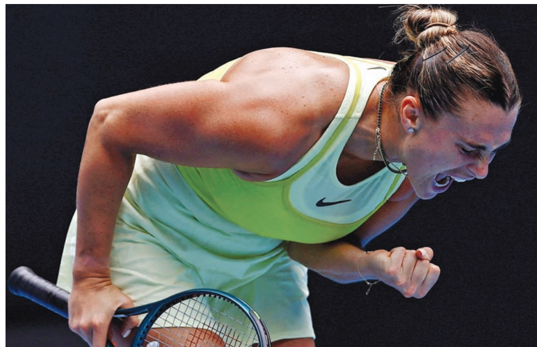
Belarus' Aryna Sabalenka reacts during her third-round match against Denmark's Clara Tauson at the Australian Open in Melbourne yesterday.

Grand Slam king Novak Djokovic was in vintage form for his late match against Tomas Machac