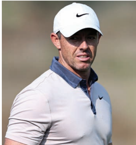
Rory McIlroy of Northern Ireland looks on after a shot during day two of the Dubai Desert Classic 2025 yesterday.

"Not the way you want to start the year, but if there's any positive side of it, it is the beginning of the year," said LIV star Rahm, who is hoping to play well enough on the European Tour to automatically qualify for Luke Donald's Ryder Cup team later this year.