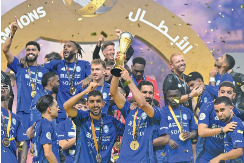
Al Nasr players celebrate with the trophy at the Al Maktoum Stadium in Dubai yesterday.

The tussle continued as the two sides shared