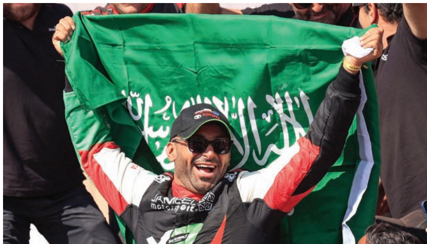
Yazeed al-Rajhi celebrates after winning the Dakar Rally title in the car category at the end of the 12th and last stage in Shubaytah, Saudi Arabia, yesterday.

"I'm very, very happy to do it. It's not an easy race, it's the toughest one that I've done in 11 years," al-Rajhi said. "For sure, we've made a lot of records today. The first Saudi driver to win and also in the last 25