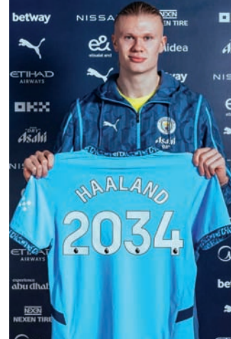
his first season at the Etihad, in 2022/23.

Haaland fired 52 goals in all competitions to help the club win a Champions League, Premier League and FA Cup treble in