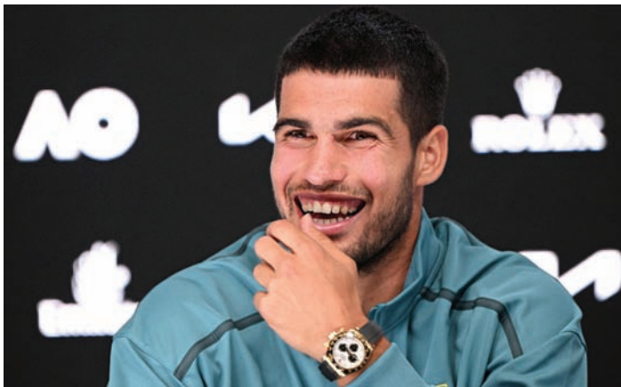
Spain's Carlos Alcaraz speaks at a press conference on day six of the Australian Open yesterday.

struggled but she came away unscathed from a 7-6(5) 6-4 victory over Clara Tauson that kept the Belarusian on track for her third straight title.