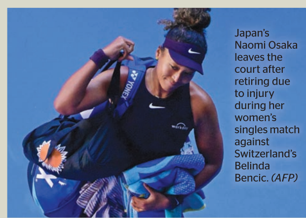
Japan's Naomi Osaka leaves the court after retiring due to injury during her women's singles match against Switzerland's Belinda Bencic.

"It's not the way you want this match to end. I thought it was getting to be a good match," Bencic said. "Hopefully she will be fine soon and can play well for the rest of this year."