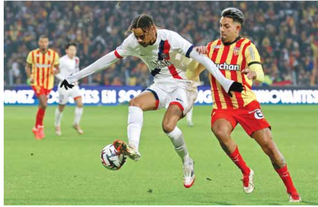
Paris Saint-Germain's forward Bradley Barcola (left) vies with Lens' defender Facundo Medina during the Lique 1 match at Stade Bollaert-Delelis in Lens, France, yesterday.