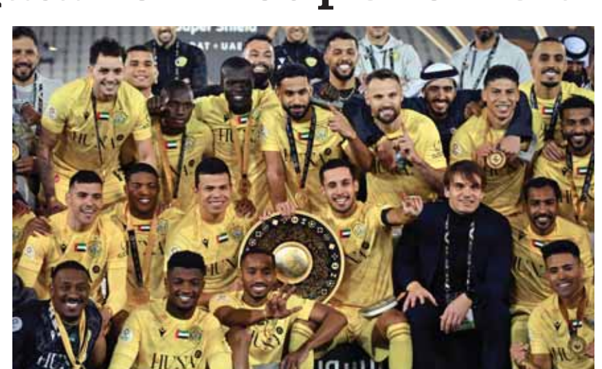
Al Wasl players celebrate after winning the Qatar-UAE Super Shield at the Jassim Bin Hamad Stadium in Doha.