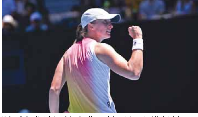
Poland's Iga Swiatek celebrates the match point against Britain's Emma Raducanu vesterdav.

Svitolina said the supportive presence of husband Gael Mon-