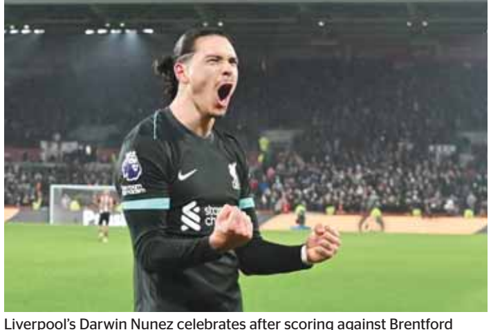
Liverpool's Darwin Nunez celebrates after scoring against Brentford during the Premier League match in London.

could not keep it out. Just when Mikel Arteta's men