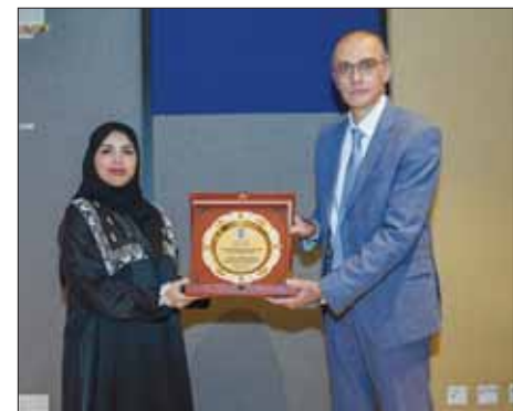
The winter school featured a four-day programme.

She further explained that such events serve as a platform for exchanging experiences among academics, specialists, and students, ensuring that the academic and professional community is well-equipped to effectively engage with advanced technologies such as artificial intelligence and software engineering.