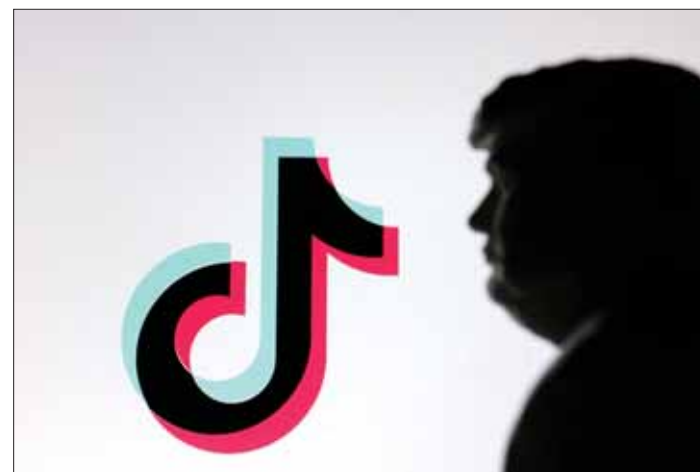
A 3D-printed miniature model of Donald Trump and TikTok logo are seen in this illustration taken yesterday.

lowing Trump's comments, TikTok said it "is in the process of restoring service".