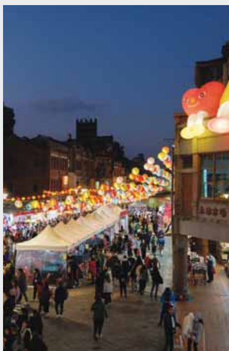
A street is filled with festive decorations for the upcoming Lunar New Year in Taipei.