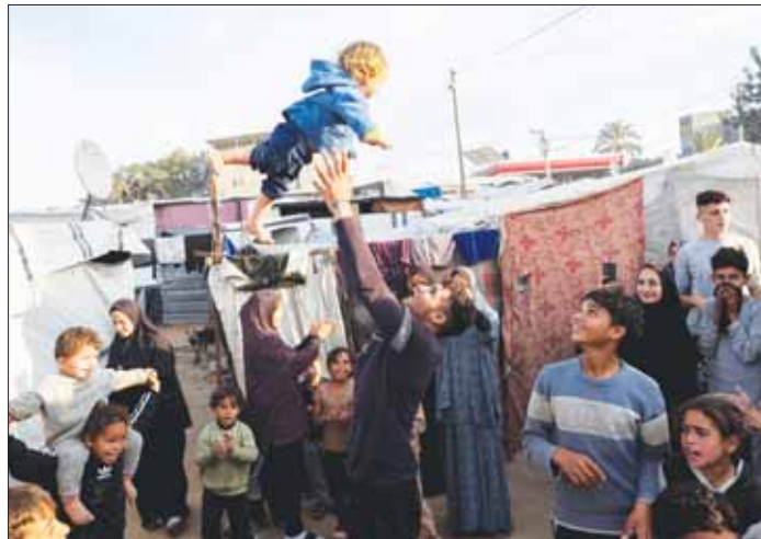
A man throws a child into the air as Palestinians celebrate the ceasefire between Israel and Hamas, in Deir Al-Balah in Gaza, yesterday.

A total of 33 Israeli hostages are due to be returned from Gaza