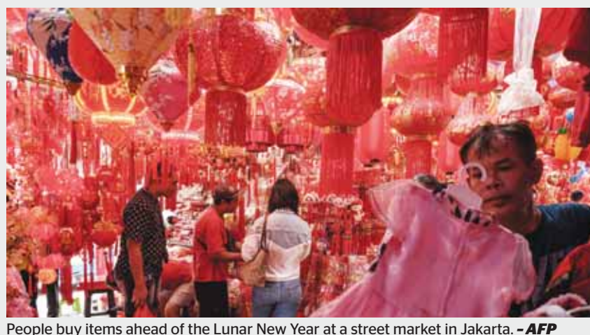
People buy items ahead of the Lunar New Year at a street market in Jakarta.