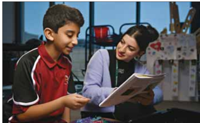
QF is helping to shape responsible digital citizens.