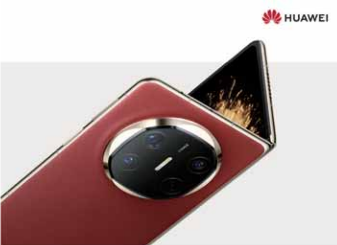
HUAWEI Mate X6

The HUAWEI Mate X6 introduces the Ultra Chroma Camera, which uses an astonishing 1.50 million spectral channels to improve colour accuracy by 120%. This allows the cameras to capture true-to-life colours, whether it's the subtle hues of human skin or the vibrant shades