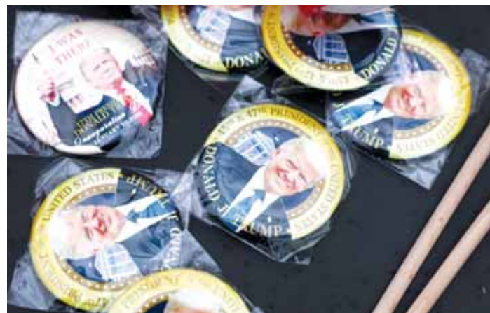
Souvenirs for President-elect Donald Trump being sold in Washington, DC ahead of his inauguration tomorrow.

kept their distance are competing to win his favour. The world's richest person, Tesla CEO Elon Musk, has volunteered to help Trump overhaul the government, while Meta CEO Mark Zuckerberg and Amazon founder Jeff Bezos will feature prominently at his swearing-in ceremony.