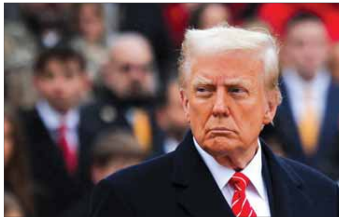
US President-elect Donald Trump attends a wreath laying ceremony at Arlington National Cemetery ahead of the presidential inauguration, in Arlington, Virginia, yesterday. Right: Supporters of Trump gather outside Capital One Arena for a rally in Washington.