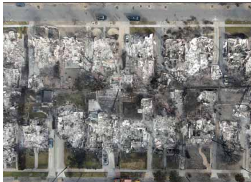
A drone view shows the extent of the damage of a neighbourhood block at the Eaton Fire in Altadena, California, yesterday.

Exhausted Los Angeles firefighters yesterday braced for the return of yet more dangerously strong gusts, as California's governor slammed "hurricane-force winds of misinformation" surrounding blazes that have killed 27 people.