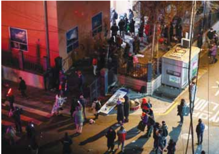
ALL THE PRESIDENT'S MEN: Supporters of South Korean President Yoon Suk-yeol enter the Seoul Western District Court in Seoul early yesterday after it extended the detention of the impeached leader.

South Korean regulations require a suspect detained under a warrant to undergo a physical