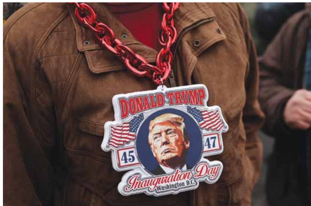
A supporter wears a chain with a pendant depicting US President-elect Donald Trump as supporters gathered outside Capital One Arena, ahead of a rally for Trump yesterday.

Argentina's president, Javier Milei, a strong supporter of Trump's, has said he will attend,