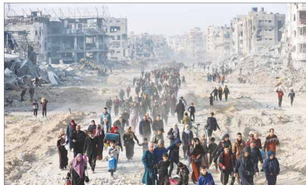
Scores of displaced Palestinians walk along a road in the Saftawi area of Jabalia, as they leave areas near Gaza City where they had taken refuge, toward the further northern part of the Gaza Strip, shortly after a ceasefire deal in the war.