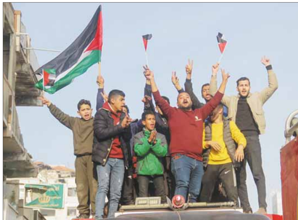
Palestinians celebrate ceasefire between Israel and Hamas, in Gaza City, yesterday.