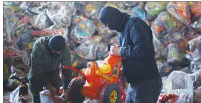
Members of the security forces with Syria's new government inspect toys inside a warehouse that used to hide pills of Captagon, a brand name of the psychostimulant drug Fenethylamine, inside children's toys, hookahs, house doors and plastic insulation, during a raid in Latakia, yesterday.

An AFP photographer saw security personnel in a Fourth Di-