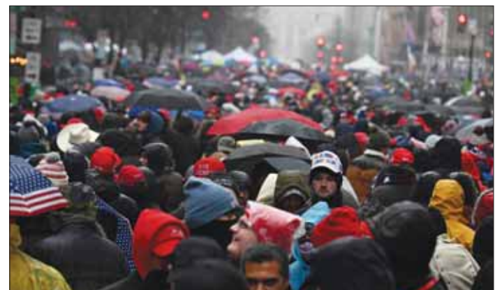
Supporters of US President-elect Donald Trump wait outside for a victory rally at Capital One Arena in Washington, DC yesterday.

The line of supporters, many dressed in Trump's trademark red jackets and MAGA hats, stretched over several downtown Washington blocks. Some chanted "USA! USA!" and others spoke over meg-