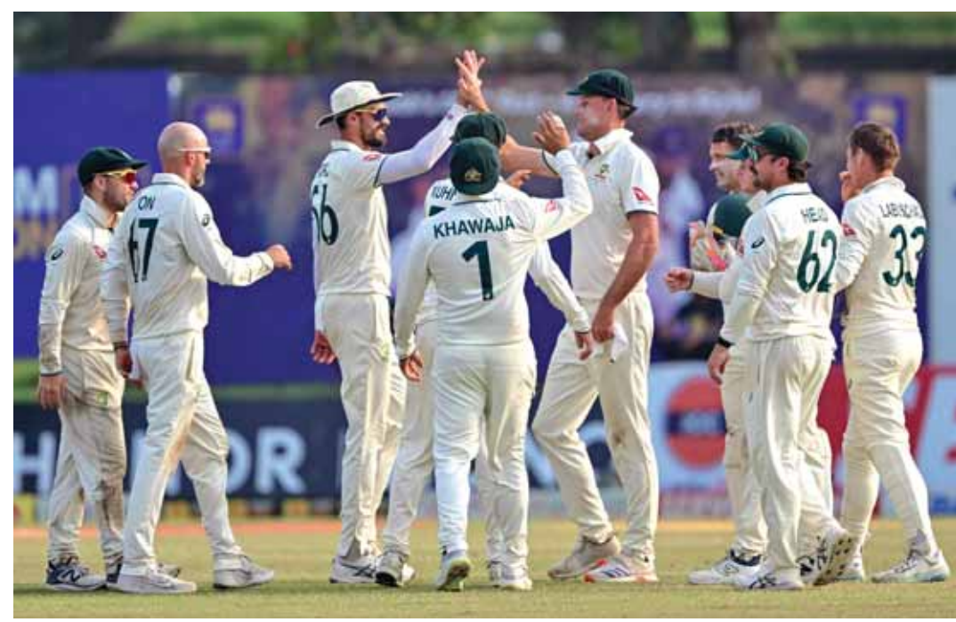
Australia's players celebrate after the dismissal of Sri Lanka's Angelo Mathews during the third day of the second Test at the Galle International Cricket Stadium in Galle yesterday.

in the afternoon session when a delivery from Lyon drifted down the leg-side. It clipped the helmet placed behind the wicketkeeper for a close-in fielder, and triggered an automatic five-run penalty for Sri Lanka, a rare bonus in a match where runs were hard to come by.