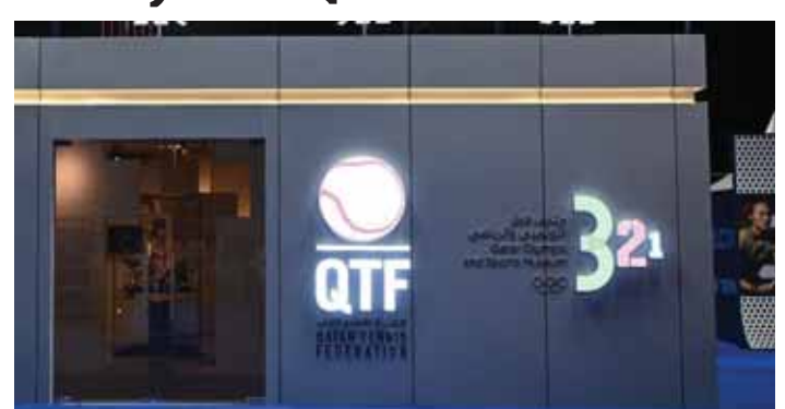
Set to open today at the Khalifa International Tennis & Squash Complex, the exhibition will be accessible throughout the duration of the Qatar TotalEnergies Open and the Qatar ExxonMobil Open

Additionally, the exhibition will showcase iconic moments featuring international tennis stars who have played in Oatar, further cementing the country's role in global tennis. Other notable pieces on display will highlight the rich history of international tennis, with