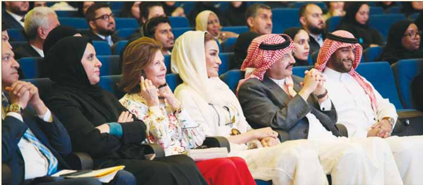
Her Highness Sheikha Moza bint Nasser attends the Social Entrepreneurship Programme showcase for the Mentor Arabia and Akhlaquna Initiatives.

neurship Programme aims to empower young people by equipping them with the skills and support needed to develop impactful social initiatives that align with the vision of the 'Akhlaquna' initiative." She added, "Education at QF goes beyond academic achievement; it is about shaping character, fostering social responsibility, and instilling ethical values."