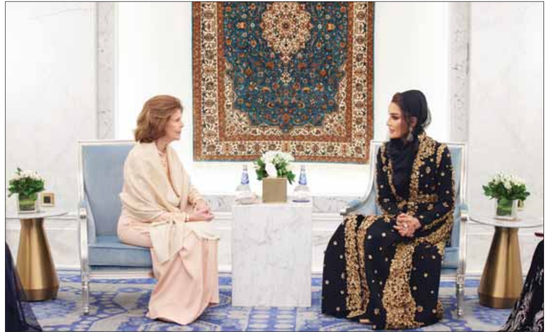
Her Highness Sheikha Moza bint Nasser meets with Queen Silvia of Sweden.

H er Highness Sheikha Moza bint Nasser, Chairperson of Education Above All (EAA) Foundation, attended the Mentor Arabia Gala Dinner yesterday in collaboration with EAA.