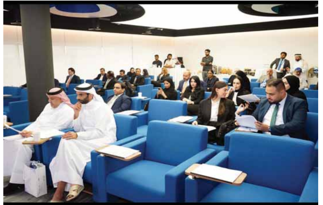
Some of the attendees at the General Assembly