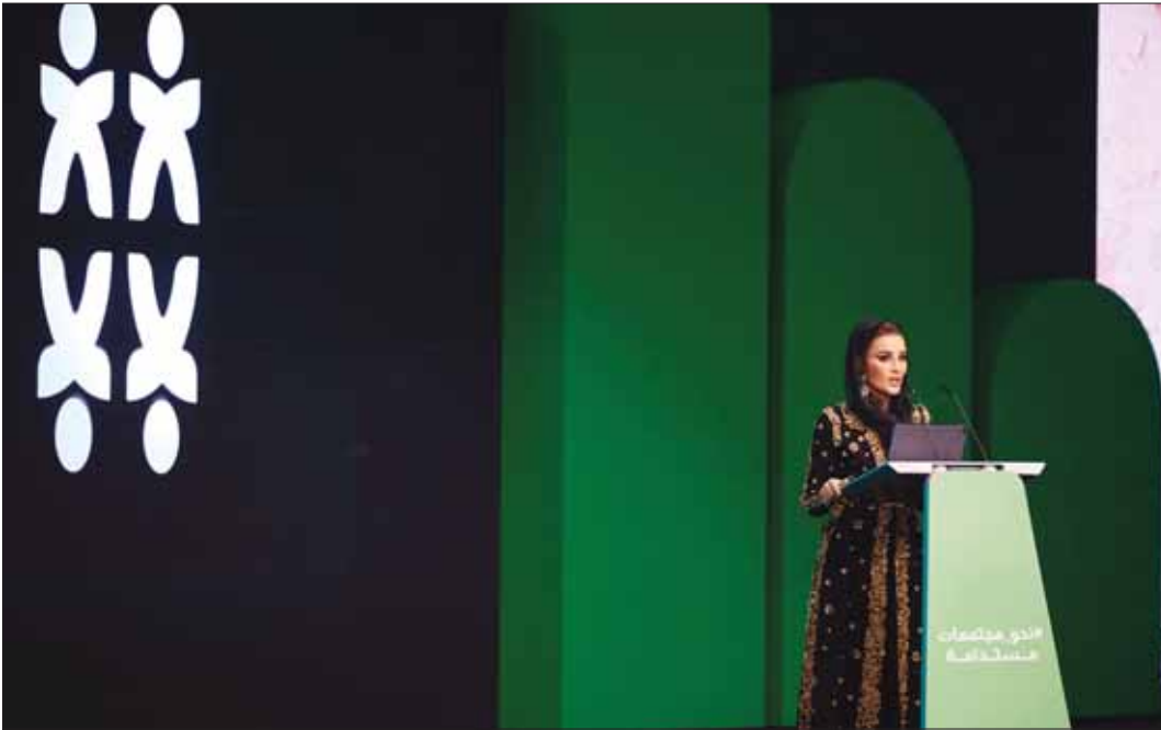
Her Highness Sheikha Moza bint Nasser addressing the the Mentor Arabia Gala Dinner.