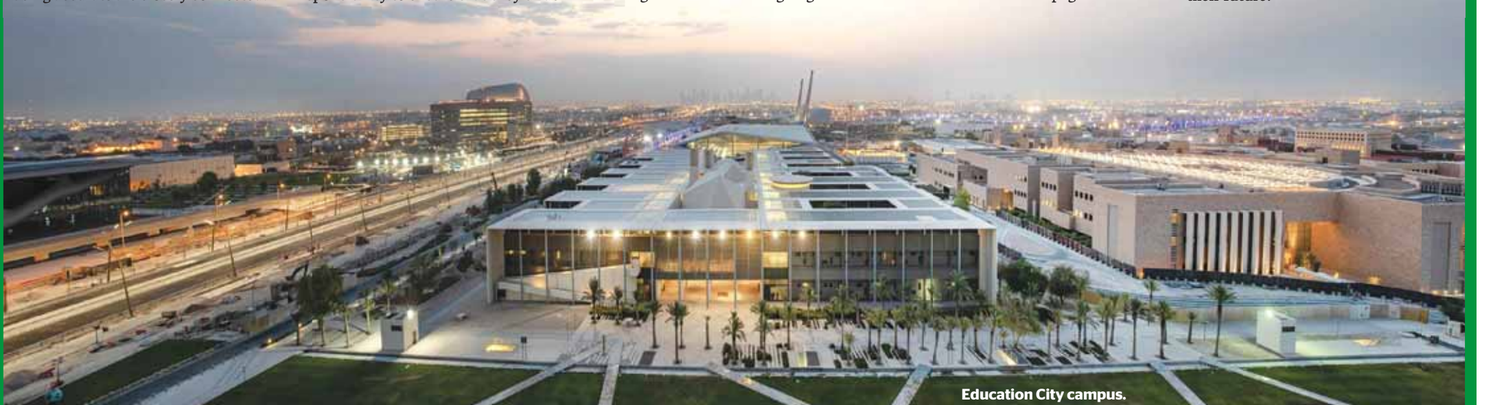
Education City campus.

With professors like Uday Chandra leading the way, QF is positioning itself at the cutting edge of AI-driven education offering students not just theoretical knowledge but practical insights into the technologies shaping their future.