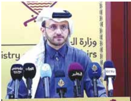
HE Dr Majed al-Ansari

Dr al-Ansari said that while "there are no specific dates", recent statements from the Israeli side have been positive, which gives hope that conditions would be in place for the second phase.