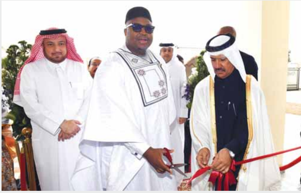
The embassy of Sierra Leone was inaugurated in Doha yesterday. The inauguration ceremony was attended by the Minister of Foreign Affairs and International Co-operation of Sierra Leone Alhaji Timothy Musa Kabba and HE Secretary-General of the Ministry of Foreign Affairs Dr Ahmed bin Hassan al-Hammadi. (QNA)