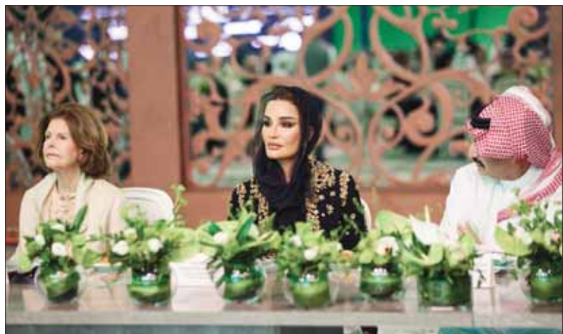
Her Highness Sheikha Moza bint Nasser is flanked by Queen Silvia of Sweden and Prince Turki bin Talal bin Abdulaziz al-Saud at the Mentor Arabia Gala Dinner for youth empowerment yesterday. Page 9