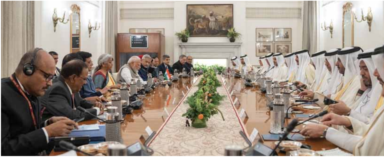
The delegation led by His Highness Sheikh Tamim bin Hamad al-Thani at a key meeting with the delegation led by India's Prime Minister Narendra Modi.