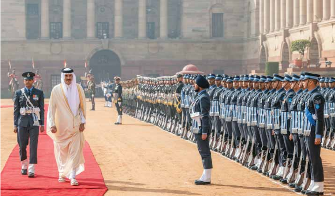
Snapshots from His Highness the Amir Sheikh Tamim bin Hamad al-Thani's state visit to India.