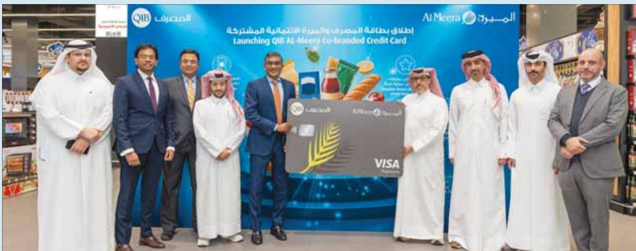
The new co-branded credit card provides cardholders with exclusive rewards and adds convenience to their everyday shopping.