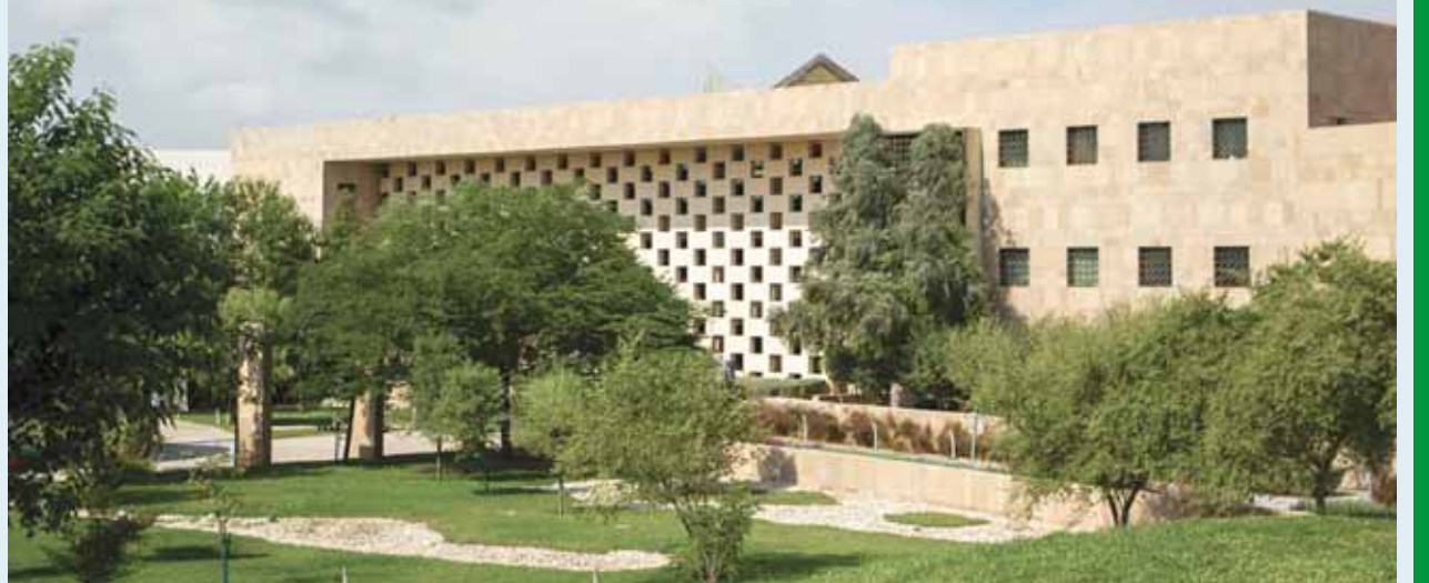
Georgetown University in Qatar campus.

A: We need to model best practices in a classroom, whether AI-related or not. We must not be afraid to demonstrate how to use AI tools and platforms in a classroom setting. We should also reconsider assessment or the kinds of assignments we ask students to complete. Students need to see what bad or poor AI output looks like in order to avoid the temptation of a quick fix. We shouldn't overestimate young people's knowledge about AI tools. They are learning too, and universities have a responsibility to ensure that they under-