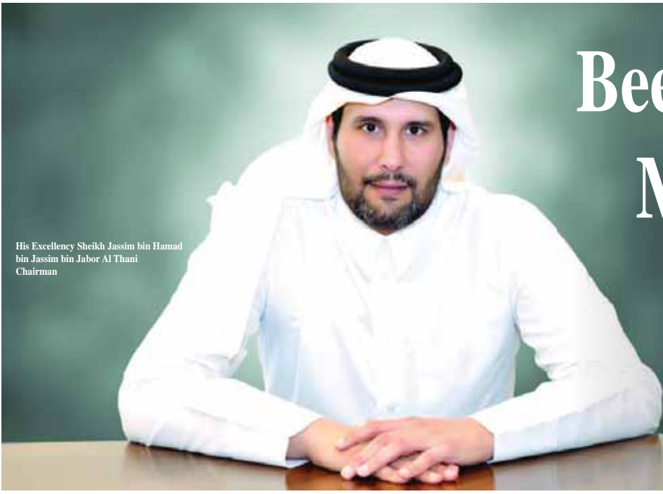
His Excellency Sheikh Jassim bin Hamad bin Jassim bin Jabor Al Thani Chairman