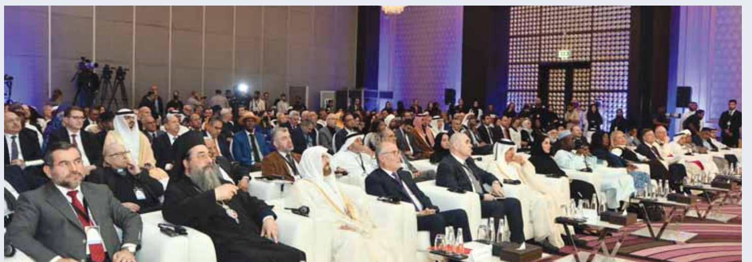
A section of the audience at the conference.