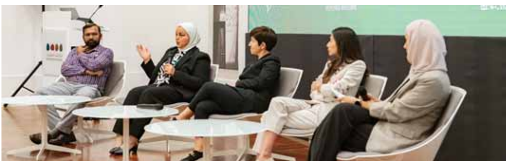
Experts at the Science Cafe discussion.

Msheireb Museums and Sidra Medicine organised the first session of 2025 Science Café Series, titled 'Nurturing Health: Our Microbiome and AI-Driven Insights for Wellness', bringing together experts and a large audience at Msheireb Downtown Doha's Bin Jelmood House on Monday.