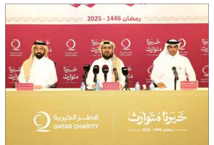
QC officials at a press conference to announce the Ramadan campaign.

Donors can easily calculate and give their Zakat through the "Home Collector" service on the app (qch.qa/appen), or by calling 44290000. They can also donate at QC's branches and mall collection points in shopping malls.