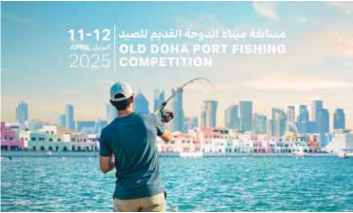
footage of the fishing process, boat registration, and weight verification. Final submissions must be sent to the organising committee by 8pm on day one. On April 12, the final day of the

celebrate tradition and togetherness. Registration will continue until 2pm on April 11. To secure a spot, participants are encouraged to call 55734539. Teams must be led by a Qatari captain (nukhatha), though residents may join as team members. Participation requires submitting a completed registration form, personal identification for all team members, and a valid boat registration. This year's competition focuses exclusively on kingfish (kan'ad), a prized regional catch. Participants will set sail from Old Doha Port at sunrise on April 11 for a full day at sea, where they will submit a video documenting their single best catch of the day, including full