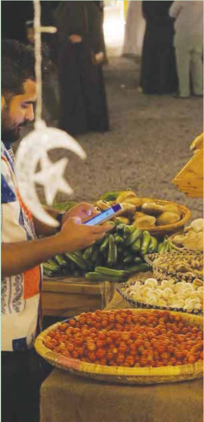
Ramadan at Torba Farmers Market in Education City.

Centre (DECC) before the Ramadan and Eid Shopping Exhibition closes its doors tomorrow. It features a wide array of products, from dates and honey to homeware and clothing, ideal for Eid preparations. Similarly, the Eid Sweets Exhibition at Souq Waqif's Eastern Square, showcasing the finest traditional and international sweets in a family-friendly atmosphere, will conclude tomorrow. For a taste of Qatari heritage, the second edition of Visit Qatar's Throwback Food Festival at Old Doha Port will be open until tomorrow, the last day of Ramadan. This festival celebrates local heritage through traditional cuisine and cultural experiences, recreating the atmosphere of old Qatari souqs through the Dakkan initiative. Visitors can sample traditional foods and sweets, participate in interactive competitions like Kahoot and a treasure hunt focused on heritage, and even witness chefs battling it out in the "Local Flavour Challenge". The Throwback Food Festival also features live musical performances of traditional songs, complete with instruments like drums, oud, and marwas. The immersive Ramadan at Hosh Msheireb , inspired by traditional Qatari family gatherings, will also conclude tomorrow. While some Ramadan-specific events