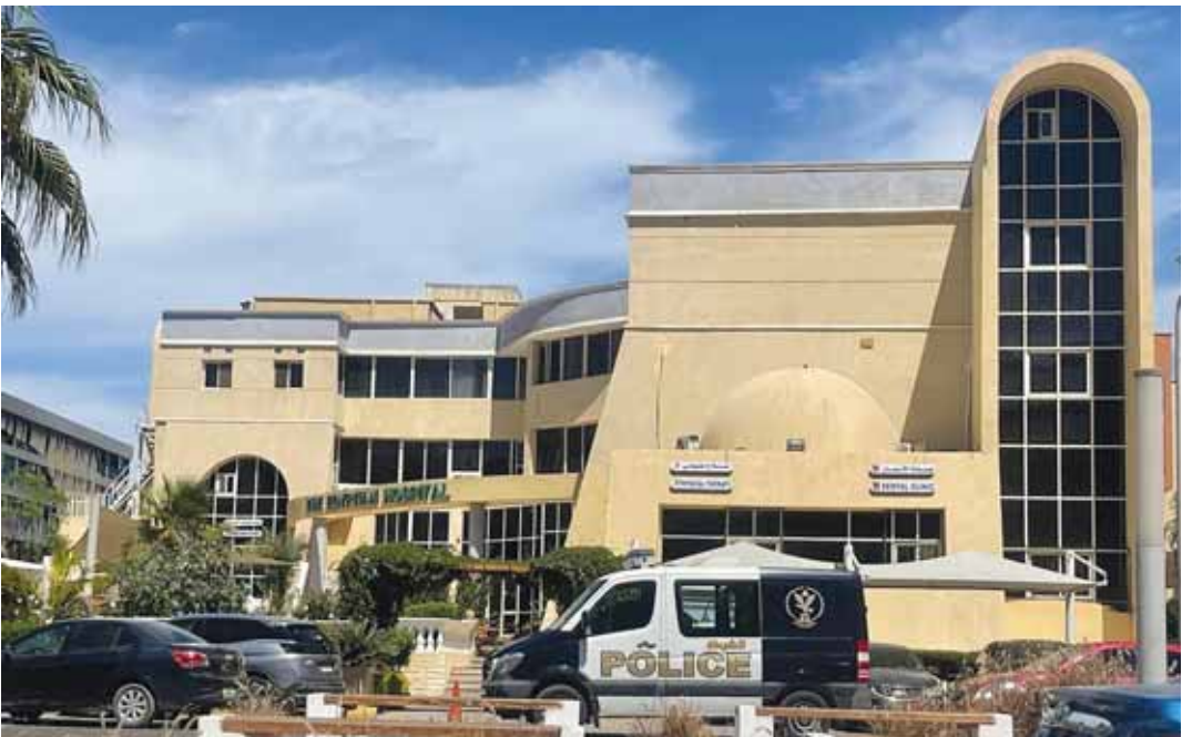
A police vehicle is parked in front of the hospital where survivors are treated.

ing to initial information, “most of those on board were rescued and taken to their hotels and hospitals in Hurghada”. Investigations were underway to determine the cause of the accident, the governor's office said, adding that 21 ambulances had been dispatched. The submarine “had a valid license and its crew leader had the requisite academic qualifications,” they added. “Six people were struggling under the water and we were able to pull them out,” a Sindbad employee told the governor in the hospital, according to a video shared by the governor's office. Four survivors, including at least one minor, were admitted to intensive care, according to the official statement. Hurghada, a resort town about 400km southeast of the Egyptian capital Cairo, is a major destination for visitors to Egypt, with its airport receiving more than 9mn passengers last year, according to state media. Thursday's forecast in the city was clear, with above average wind speeds reported but optimum visibility underwater. While dozens of tourist boats sail through the area daily for snorkelling and diving activities, Sindbad Submarines says it deploys the region's “only real” recreational submarine. The vessel had been operational in the area for multiple years, according to a source familiar with the company. The Red Sea's coral reefs and islands off Egypt's eastern coast are