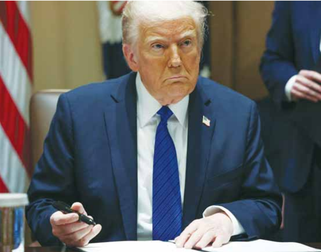
US President Donald Trump looks in the distance on the day of a meeting with American ambassadors at the White House in Washington, DC, on Tuesday.

• Stephen S Roach, a faculty member at Yale University and former chairman of Morgan Stanley Asia, is the author of Unbalanced: The Codependency of America and China and Accidental Conflict: America, China, and the Clash of False Narratives.