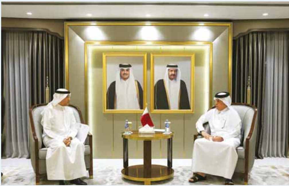
HE the Minister of State for Foreign Affairs Sultan bin Saad al-Muraikhi met with ambassador of Kuwait to Qatar Khaled Bader al-Mutairi. During the meeting, they discussed bilateral relations and ways to support and strengthen them. (QNA)