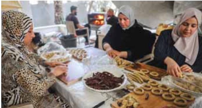
Palestinians make traditional cookies to be distributed during the upcoming Eid al-Fitr in Bureij in the central Gaza Strip yesterday.

Violence has escalated in Gaza since a January truce broke down on March 18 after two months of relative calm. (Reuters)