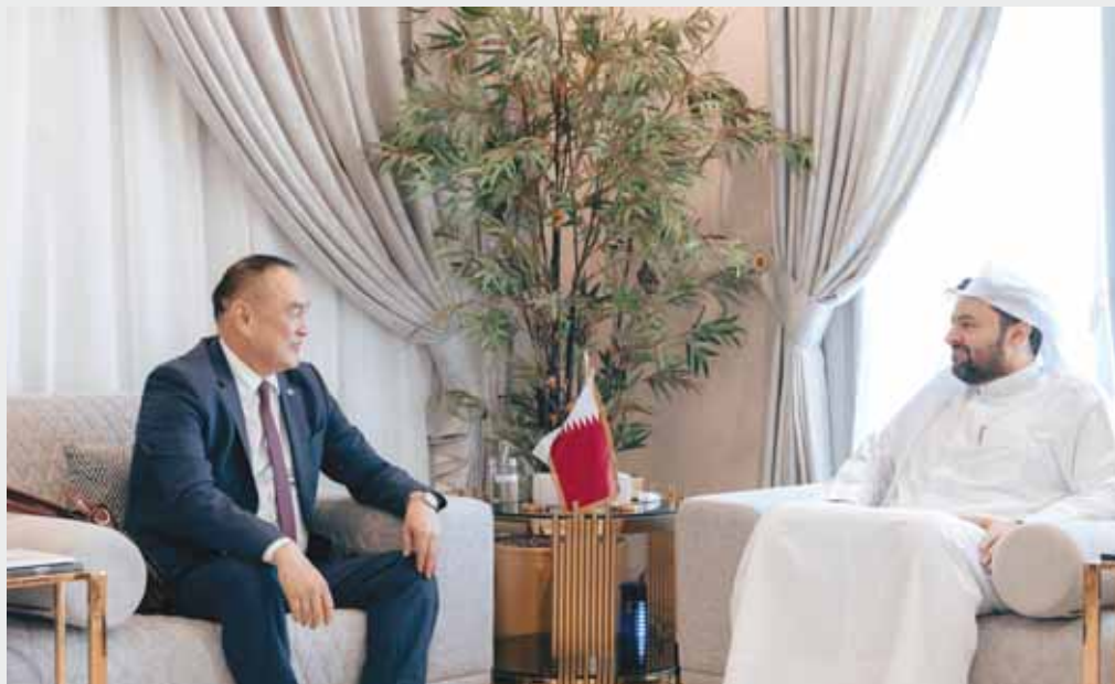
HE the Minister of State at the Ministry of Foreign Affairs Dr Mohammed bin Abdulaziz bin Saleh al-Khulaifi met yesterday with ambassador of Mongolia (non-resident) to Qatar Sergelen Purev. During the meeting, they discussed relations between the two countries and ways to support and strengthen them. (QNA)