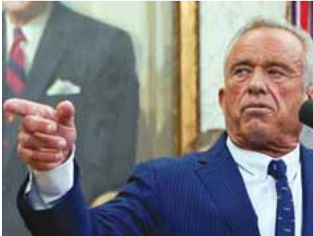
Robert F Kennedy Jr

Large government agencies like the HHS sprawl over time and there is merit in reorgan-