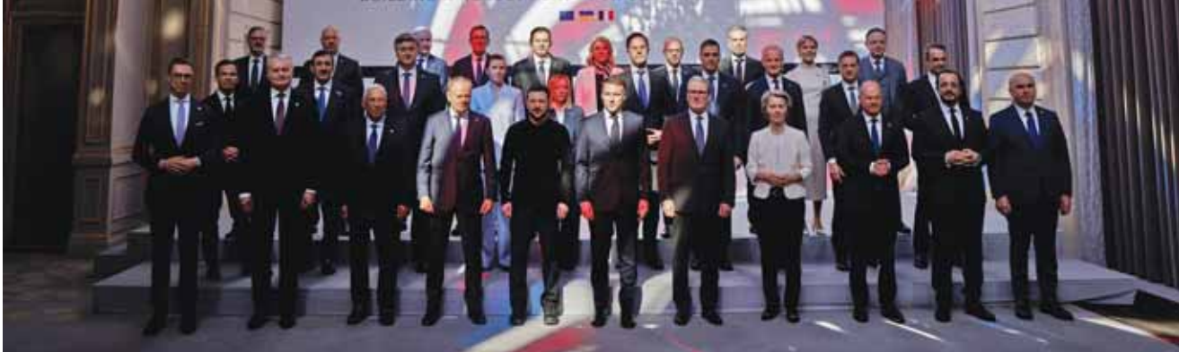
European leaders, including Ukrainian President Volodymyr Zelensky, and officials pose for a family photo during a summit for ‘Coalition of the Willing’ hosted by French President Emmanuel Macron at Elysee Palace in Paris.

In a separate briefing, German Chancellor Olaf Scholz said lifting sanctions would