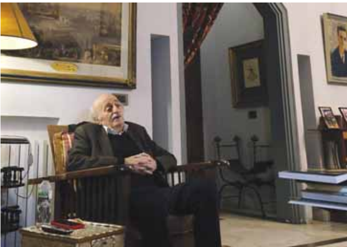
Lebanese Druze leader Walid Jumblatt speaks during an interview with AFP at his residence in Beirut.