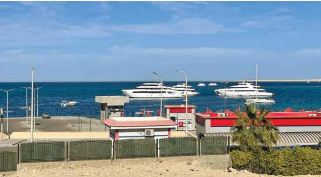
Boats sail off the resort town of Hurghada on Egypt's Red Sea coast after a submarine carrying dozens of passengers sank yesterday.

major draws, contributing to the country's tourism sector, which employs 2mn people and generates more than 10% of GDP. The area has been the site of several deadly accidents in recent years.