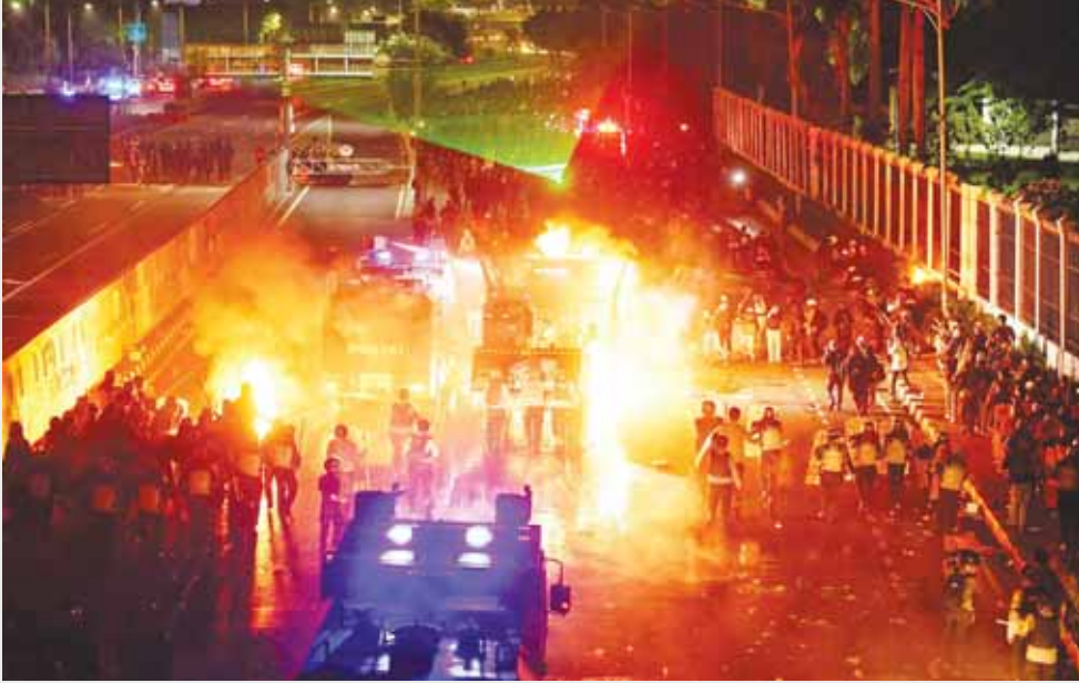
Anti-riot police disperse protesters during a demonstration against a revision to the armed forces law in front of the House of Representatives building in Jakarta, Indonesia, yesterday. The Indonesian parliament approved the amendment of the military law on March 20, despite protests that it would expand the armed forces’ role in civilian affairs. The revision to the armed forces law, pushed mainly by President Prabowo Subianto’s coalition, was aimed at expanding the military’s role beyond defence in a country long influenced by its powerful armed forces.

Possessing a ninja sword is to be banned in the UK and carry a penalty of up to six months in jail, the British government said yesterday, in a bid to curb what it has called a “national” knife crime “crisis”. The Home Office said most ninja swords had a blade of between 14 and 24 inches, with one straight cutting edge and a tanto style - or sharply-angled - tip. From August 1, anyone caught in possession of a ninja sword in private could face six months in prison. That is set to rise to two years under forthcoming legislation. There is already a penalty of up to four years in prison for carrying any weapon in public. The ninja sword ban is the final part of the so-called Ronan’s law, a raft of anti-knife crime measures introduced in parliament last month as part of the government’s crime and policing bill. The measures include making retailers report bulk or suspicious sales to police and a rise in jail terms to two years for selling weapons to children.