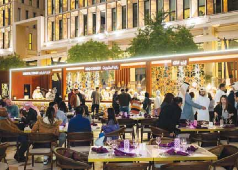
Ramadan at Hosh Msheireb, inspired by traditional Qatari family gatherings, will also conclude tomorrow.

From nostalgic flavours at the Throwback Food Festival to traditional treats at Souq Waqif, Qatar's Ramadan celebrations are set to conclude tomorrow (March 29), providing residents and visitors a final opportunity to enjoy the festive spirit, according to Visit Qatar.