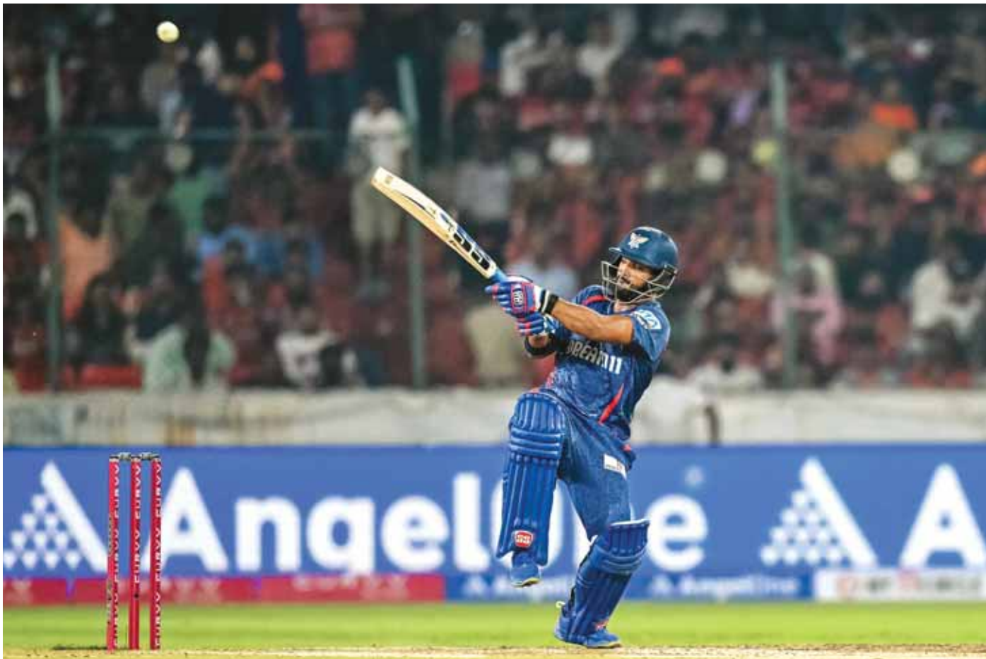
Lucknow Super Giants' Nicholas Pooran plays a shot during the Indian Premier League match against Sunrisers Hyderabad at the Rajiv Gandhi International Stadium in Hyderabad yesterday.

Shardul Thakur finishes with his best IPL figures of 4 for 34