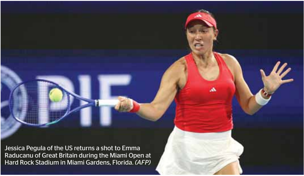
Jessica Pegula of the US returns a shot to Emma Raducanu of Great Britain during the Miami Open at Hard Rock Stadium in Miami Gardens, Florida.

F rance’s Arthur Fils upset top-seed Alexander Zverev with an outstanding display earning him a 3-6, 6-3, 6-4 win over the German in the fourth round of the Miami Open. The 20-year-old Frenchman will face 19-year-old Czech Jakub Mensik in the quarter-finals with both players chasing their first Masters 1000 semi-final spot. Rallying from a set down, Fils showed great determination to fight his way back and go 4-1 up in the second set. Zverev responded to take a 3-1 lead early in the third but again Fils refused to let the match slip from his grasp. Fils, using his athleticism and his powerful forehand, broke back to 3-2 and then when Zverev went long on a return took a 4-3 lead. Zverev held when serving to stay in the game at 5-4 down but Fils kept his composure to serve out for one of the biggest wins of his career. The victory was all the more impressive given that Fils later revealed he was suffering from back pain. “I was feeling not great in the rallies. I’ve had a little problem in my back since I was young, so sometimes it hurts me a little bit,” explained Fils. “I had to find a rhythm, (be) more aggressive and come into the court to play my game and not let him play, because when you let him play he is one of the best tennis players in