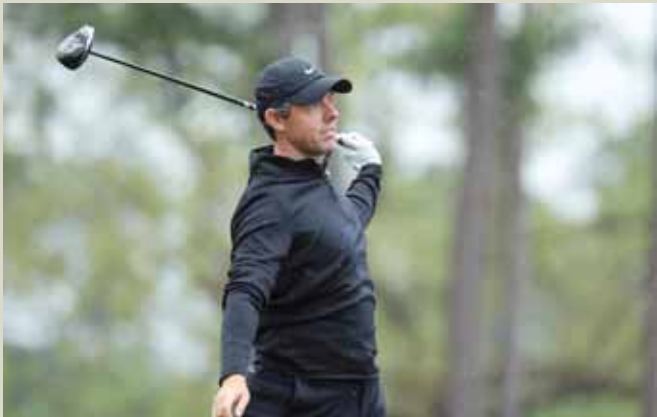
Rory McIlroy of Northern Ireland hits his tee shot on the 12th hole during the first round of the Texas Children’s Houston Open 2025.