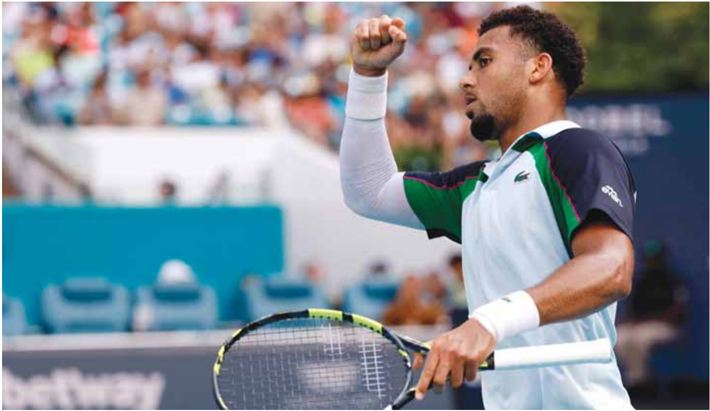
Arthur Fils of France reacts after winning a point against Alexander Zverev of Germany on day nine of the Miami Open at Hard Rock Stadium. Fils won 6-3, 6-4 to reach the quarter-finals.

‘He is one of the best tennis players in the world. I’m really happy’