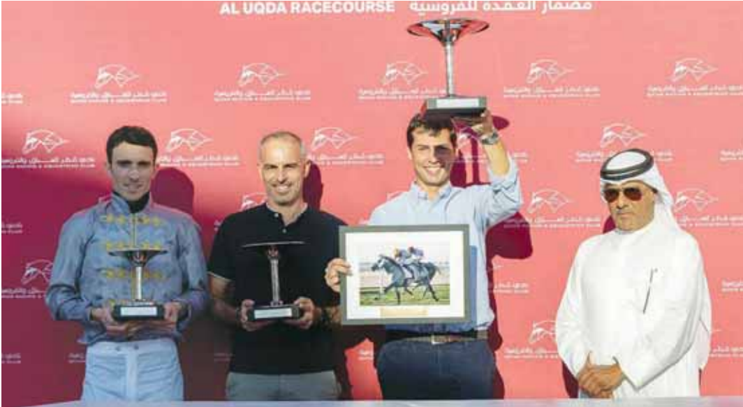
Connections of Al Zwair celebrate after the grey horse won the Msheireb Cup yesterday.