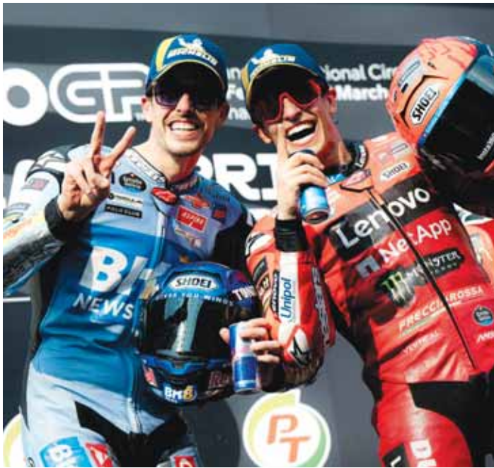
Alex Marquez (left) and his older brother Marc.