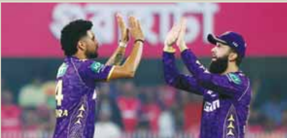
KKR's Vaibhav Arora celebrates with Moeen Ali (right) during their IPL match after taking the wicket of Rajasthan Royals in Guwahati on Wednesday.

is keen to act as a productive spin partner for Varun Chakravathy. "I'm used to bowling with somebody who is better than me and has more mystery than me, so my job there is to bowl as tight as I can and hopefully that builds pressure for that person to then get wickets," he said of Chakravathy. "Retired from international cricket, yeah, but I still play a lot of leagues and I still try to stay on top of my game because I still want to play for as long as I can and do well."