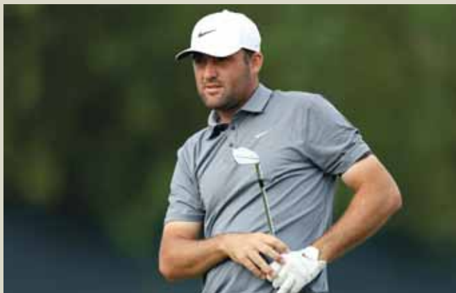
Scottie Scheffler of the United States reacts on the seventh hole prior to the Texas Children’s Houston Open 2025 at Memorial Park Golf Course in Houston, Texas.