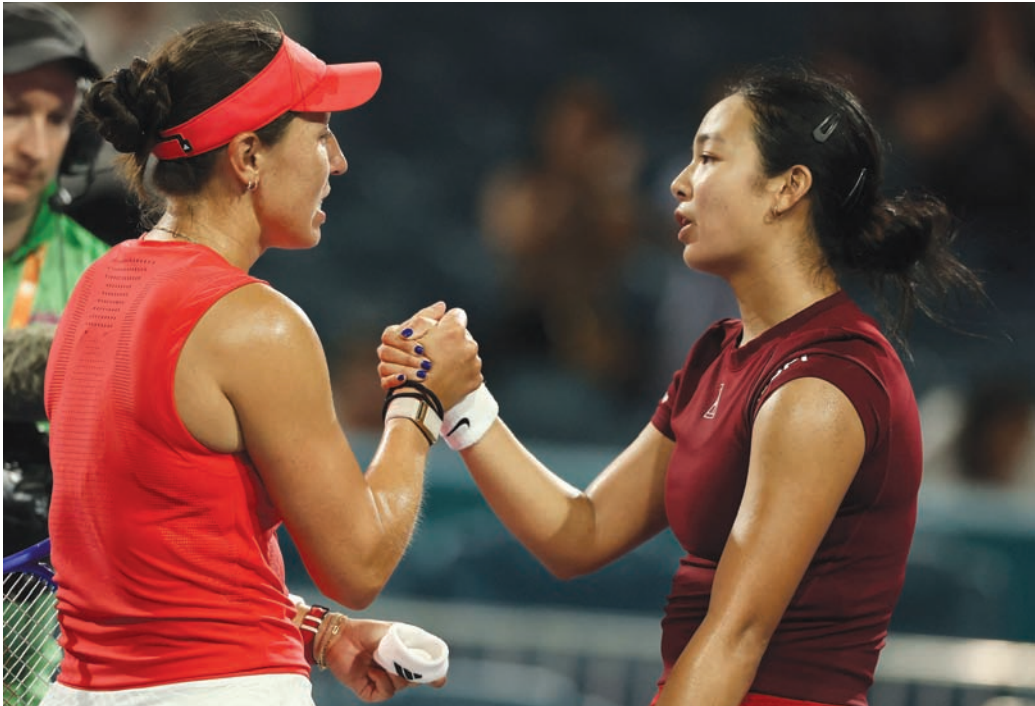
Jessica Pegula (left) of the US meets Alexandra Eala of the Philippines at the net after defeating her during Miami Open match at Hard Rock Stadium in Miami Gardens, Florida.

Philippines sensation Alexandra Eala's remarkable run at the Miami Open came to a brave end with a three-set loss to Jessica Pegula in the semi-finals on Thursday. In an enthralling battle over 2hrs 24mins, fourth-seeded American Pegula emerged with a 7-6 (7/3), 5-7, 6-3 win to seal a place in today's final against world number one Aryna Sabalenka. Sabalenka blasted her way into the final with a 6-2, 6-2 demolition of Italy's Jasmine Paolini. The 19-year-old Eala, ranked 140th in the world, had only two WTA main draw victories to her name before arriving in Miami. She proceeded to beat three Grand Slam winners in Jelena Ostapenko, Madison Keys and world number two Iga Swiatek. The lowest-ranked semi-finalist in the tournament's history, Eala seriously threatened to go one step further with another accomplished and effervescent display. The tide looked to have turned against her when Pegula broke to go 3-1 up in the second set, but Eala broke back and her fist pump and look of determination was a sign of things to come. Eala broke Pegula three times in the set and was broken twice herself but crucially was able to hold when serving for the set at 6-5. Both players protected their serve better in the deciding set but Eala's forehand let her down when the American broke to go 5-3 up and she served out for a victory that brought her visible relief. "Of course there is disappointment right after the match," said Eala. "But there are just so many times in tennis where you have