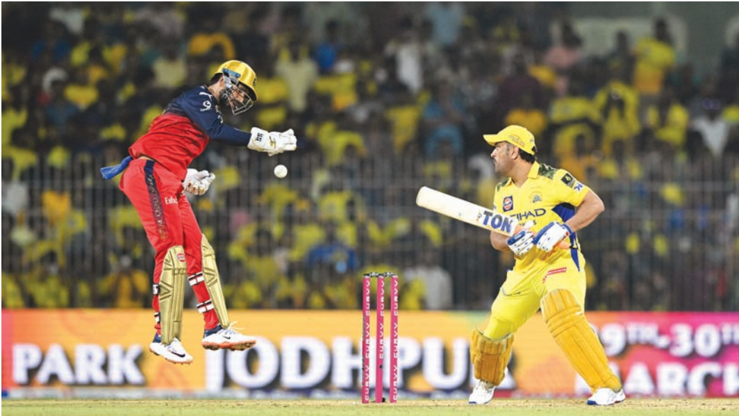
Royal Challengers Bengaluru's Jitesh Sharma keeps wicket while MS Dhoni of Chennai Super Kings bats during their IPL match at MA Chidambaram Stadium in Chennai yesterday.

missed by Kumar in the fifth over to leave the home team reeling at 26-3.