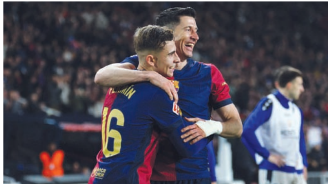
Barcelona's Robert Lewandowski celebrates with his teammate Fermin Lopez after scoring his team's third goal during the La Liga match against Osasuna in Barcelona.

Barcelona's win helped them put daylight between themselves and champions Real Madrid, while Atletico, third, are seven points behind.