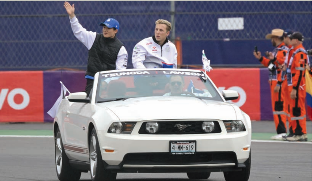
Racing Bulls' Japanese driver Yuki Tsunoda (left) and New Zealander driver Liam Lawson take part in the drivers' parade ahead of the Mexico City Grand Prix at the Hermanos Rodriguez racetrack in Mexico City on October 27, 2024.

Sergio Perez, has endured a miserable start to the season and life at one of the top teams on the grid. He has been knocked out at the first stage of all three qualifying sessions and has yet to score a point. Verstappen in the other Red Bull is second in the title race with 36 points, eight behind early season leader Lando Norris of McLaren. "We have a duty of care to protect and develop Liam, and together we see that after such a difficult start, it makes sense to act quickly so Liam can gain experience, as he continues his F1 career with Racing Bulls, an environment and a team he knows very well," Horner added. Tsunoda has shown pace on both race weekends of the season. He was 12th in the season opener at Melbourne and only finished out of the points on Sunday at Shanghai because of RB's flawed two-stop pit strategy. Tsunoda made his Formula 1 debut with AlphaTauri in 2021, becoming the first Japanese driver on the grid since Kamui Kobayashi in 2014.