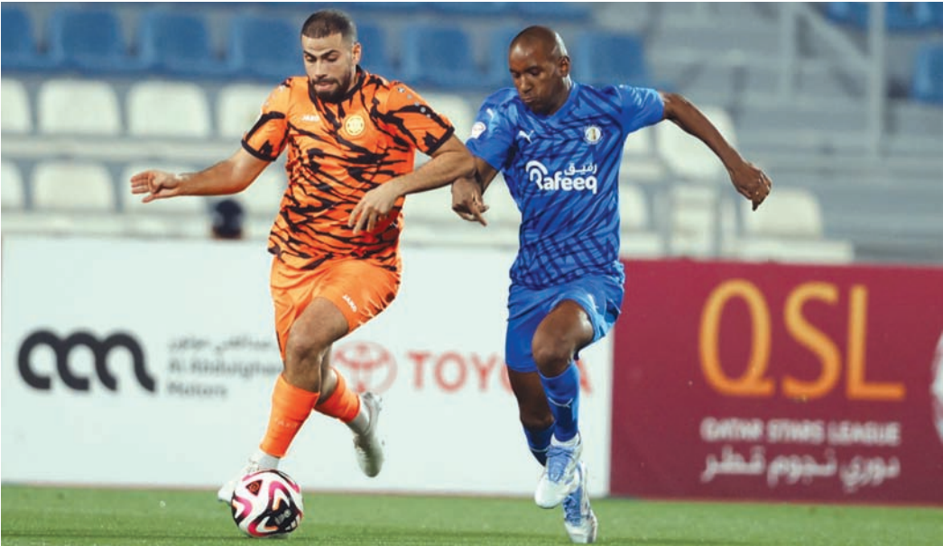
Al Khor and Umm Salal players vying for the ball during their Qatar Stars League match at the Al Khor Stadium yesterday.