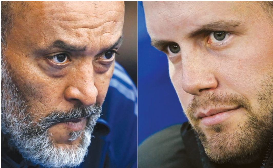
A combination of file pictures shows Nottingham Forest's manager Nuno Espirito Santo (left) and coach Fabian Hurzeler

Forest, who needed penalty shoot-outs to get past third-tier Exeter and Premier League strugglers Ipswich, hammered Brighton 7-0 in February's Premier League meeting at the City Ground, but Nuno said that result would have no bearing on this weekend's