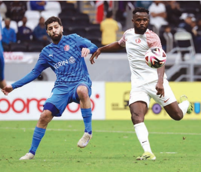
Action from Al Shamal-Al Shahania match at the Al Bayt Stadium.