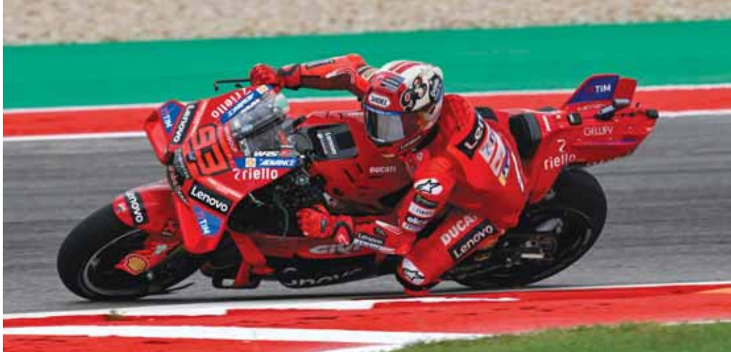
Marc Marquez of Spain and Ducati Lenovo Team rides during the Sprint session for the 2025 MotoGP Grand Prix of the Americas at Circuit of The Americas.

He secured his spot at this year’s World Athletics Championships in Tokyo, while compatriot Eleanor Patterson won the women’s high jump after clearing 1.94m.