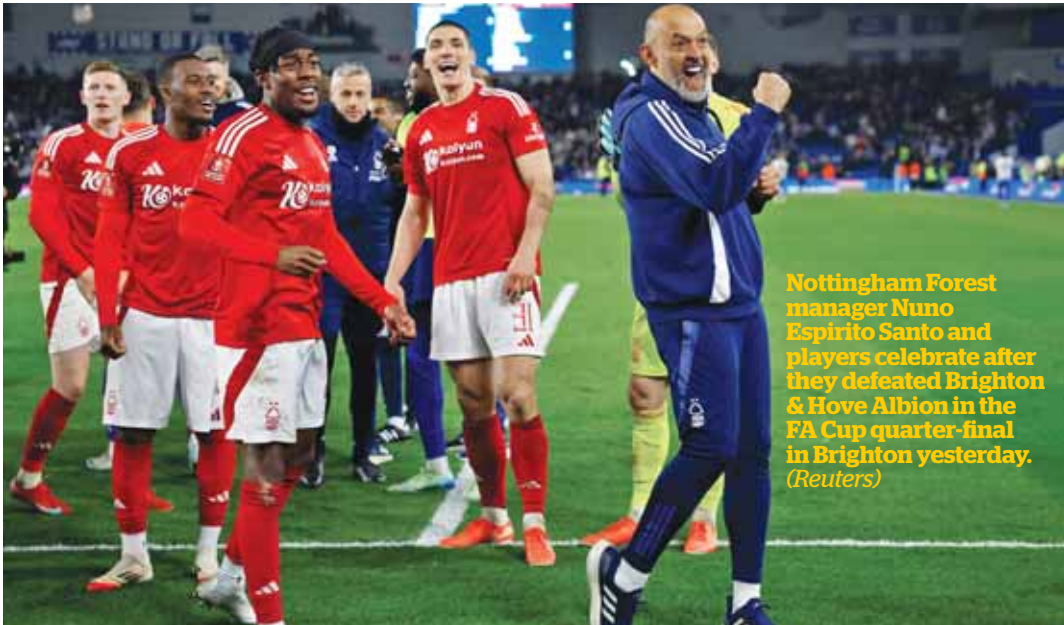
Nottingham Forest manager Nuno Espirito Santo and players celebrate after they defeated Brighton & Hove Albion in the FA Cup quarter-final in Brighton yesterday.

Forest join Crystal Palace in the last four after the Eagles won 3-0 at Fulham in yesterday's other quarter-final. Eberechi Eze in-