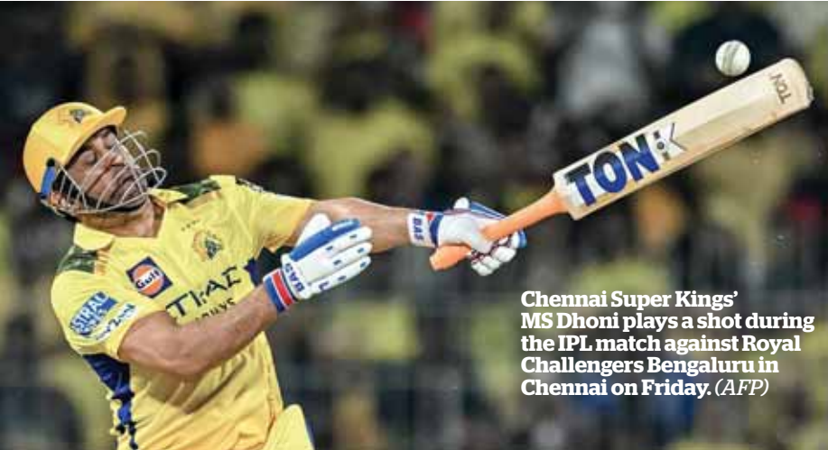
Chennai Super Kings' MS Dhoni plays a shot during the IPL match against Royal Challengers Bengaluru in Chennai on Friday.

Chennai's spinners were not really effective, while Josh Hazlewood led Bengaluru's superb pace display to set up their victory.