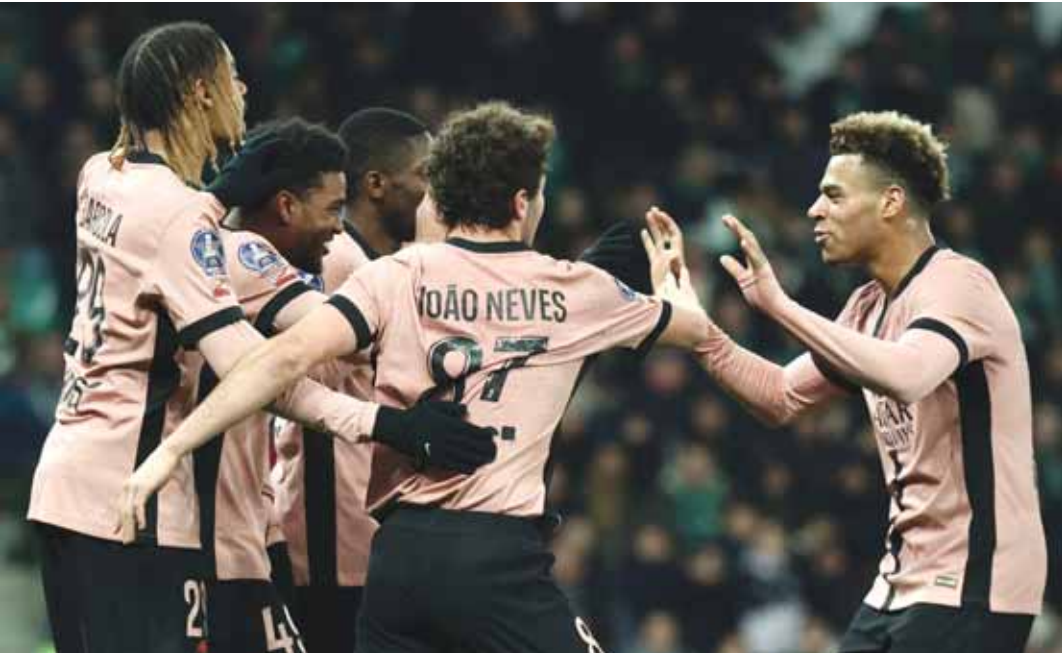
Paris Saint-Germain's Desire Doue (right) celebrates with teammates after scoring his team's sixth goal during the Ligue 1 match against Saint-Etienne at the Geoffroy-Guichard stadium in Saint-Etienne, central France, yesterday.

"It hurts to show this kind of spirit. I feel like I'm seeing guys who don't want to go into the Champions League and don't want to fight to get a taste of that," Rabiot told beIN Sports.