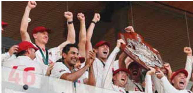
South Australia players celebrate with the Sheffield Shield after they beat Queensland in Sydney yesterday.

Sydney: South Australia claimed their first Sheffield Shield title in 29 years after hundreds by Jason Sangha and Alex Carey helped them pull off a record chase in the final against Queensland yesterday.