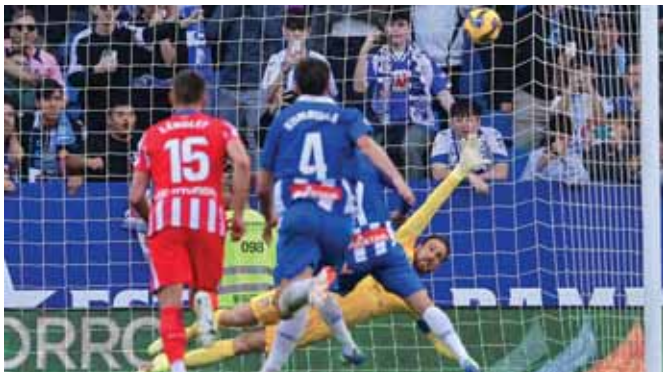
Atletico Madrid's goalkeeper Jan Oblak fails to stop a penalty shot as Espanyol's Javier Puado scores their first goal yesterday.

Puado rammed the resulting penalty into the top corner past Oblak's outstretched arm after 71 minutes. Alvarez, on from the bench, hit the sidenetting as the clock ran down on Atletico's ambitions, with Joan Garcia saving from a Griezmann header at the death. Eliminated from the Champions League by rivals Real Madrid, Simeone's side's last realistic hope of silverware is in the Copa del Rey, where they face Barcelona in the semi-final second leg on Wednesday. Espanyol are now two points above the relegation zone.