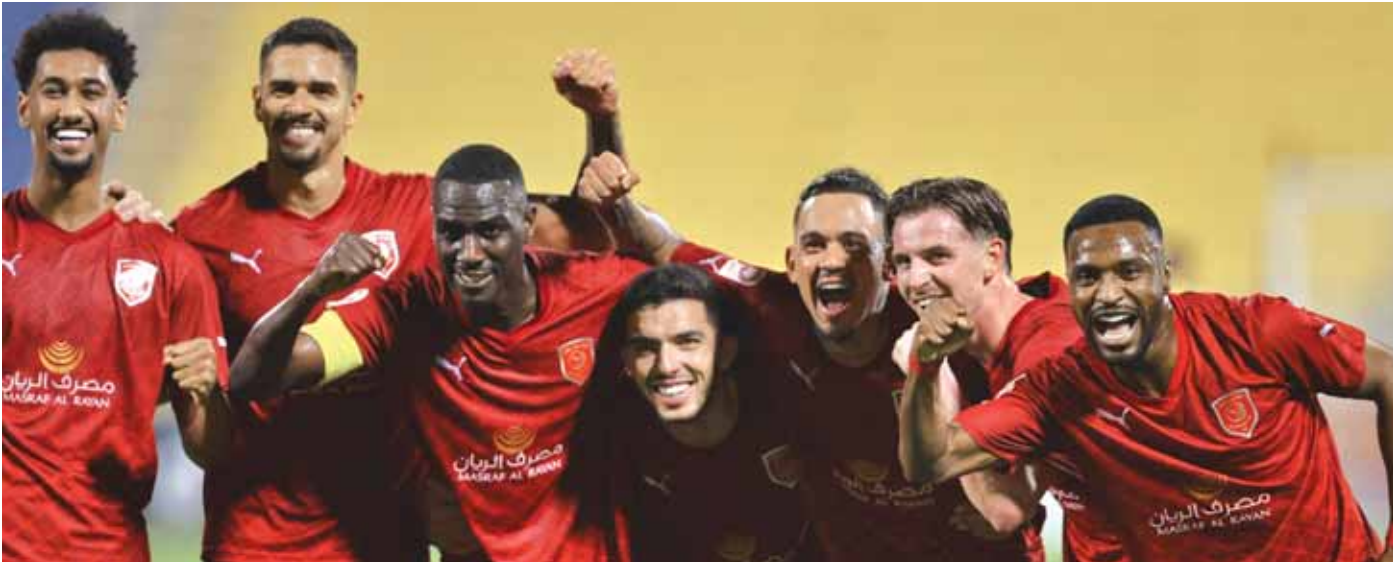
Al Duhail players celebrate after defeating Al Gharafa 2-0 in their QSL match at the Thani Bin Jassim Stadium yesterday.

Al Gharafa were more determined in the second half and they