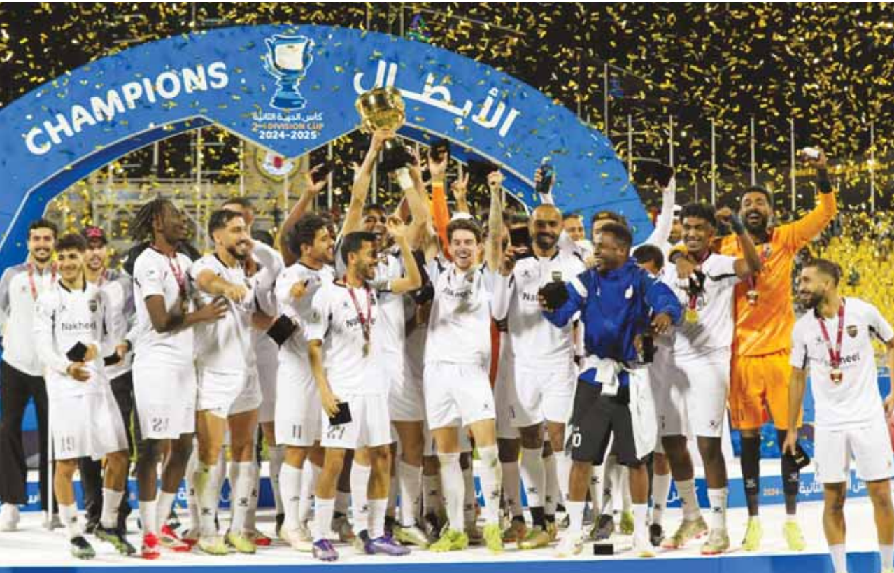
Al Bidda players celebrate after winning the Qatar Second Division Cup defeating Al Sailiya 2-0 in the final at Suhaim Bin Hamad Stadium.

sumed this season with Al Shahania as defending champions (2022-2023). Al Bidda SC have shown remarkable growth in the recent times and their success can also be traced to the signing a long-term partnership agreement with Amsterdam’s famous football club - Ajax (last year) - to manage and train their club youth programme, utilising Ajax’s worldwide renowned philosophy, culture, and methodology.