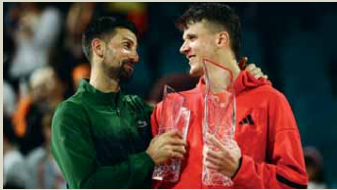
Jakub Mensik talks with Novak Djokovic (left) during the Miami Open presentation ceremony.

"Imagine me in 20 years from now, which I will be 39 playing the finals? I hope so, but it's crazy, to think about it like this."