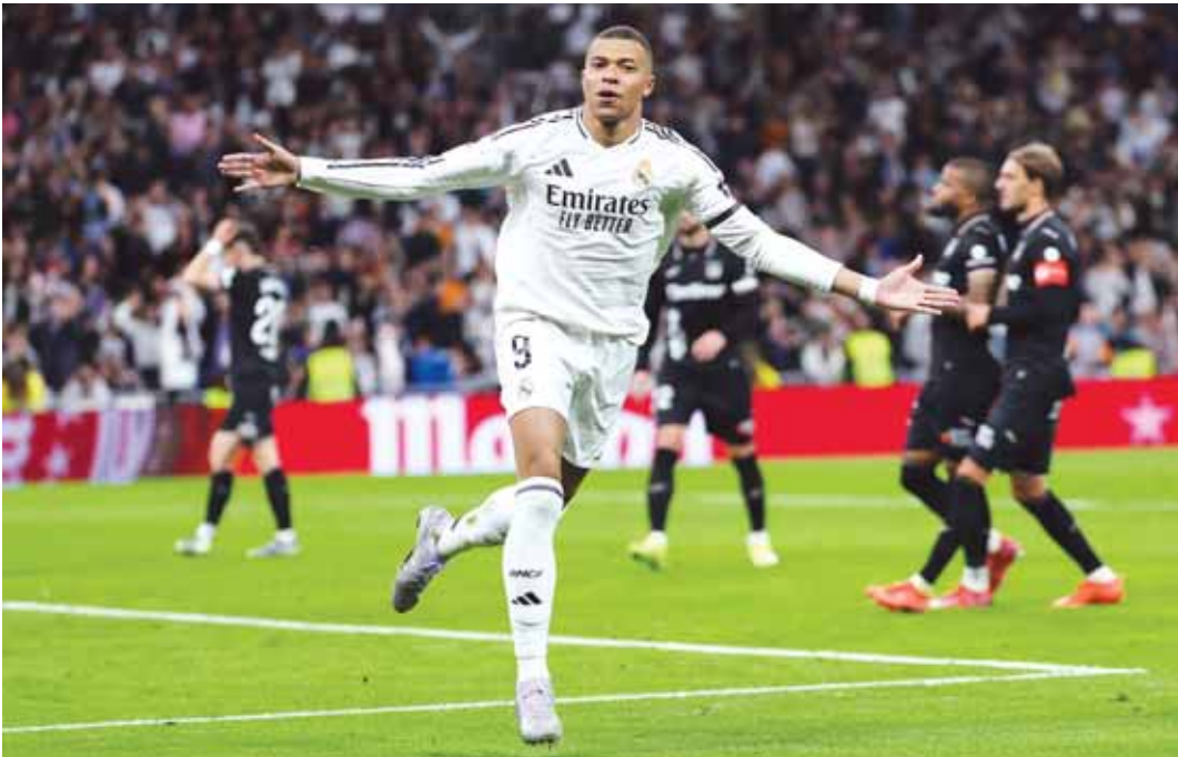
Real Madrid’s forward Kylian Mbappe celebrates after converting a penalty to score their first goal during the La Liga match against Leganes at the Santiago Bernabeu stadium in Madrid.

Real Madrid and me, we speak, he gives me a lot of advice,” Mbappe told Real Madrid TV.