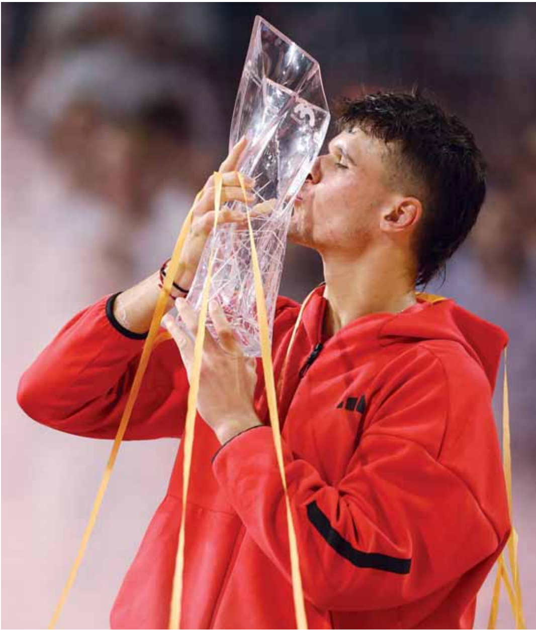
Jakub Mensik of the Czech Republic poses with the championship trophy after defeating Novak Djokovic of Serbia in the final of the Miami Open at Hard Rock Stadium in Miami Gardens, Florida.

Mensik has made no secret of the fact that he grew up with Djokovic as his idol and after receiving the trophy he said that he started his career in the hope of