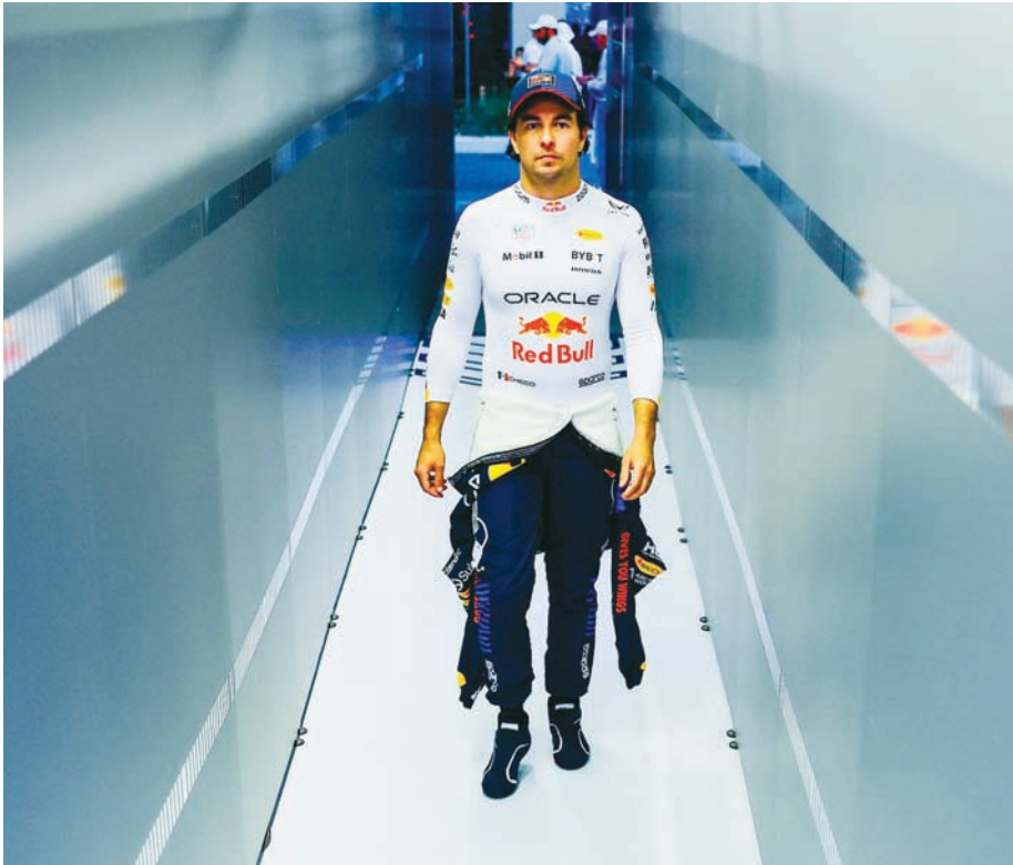
Sergio Perez, the former Red Bull driver, is spending a year away from Formula One racing.

“I wasn’t really expecting it to happen. It only became clearer once we were in Qatar, and we started to discuss and negotiate my exit of the team. It all happened very quickly.”