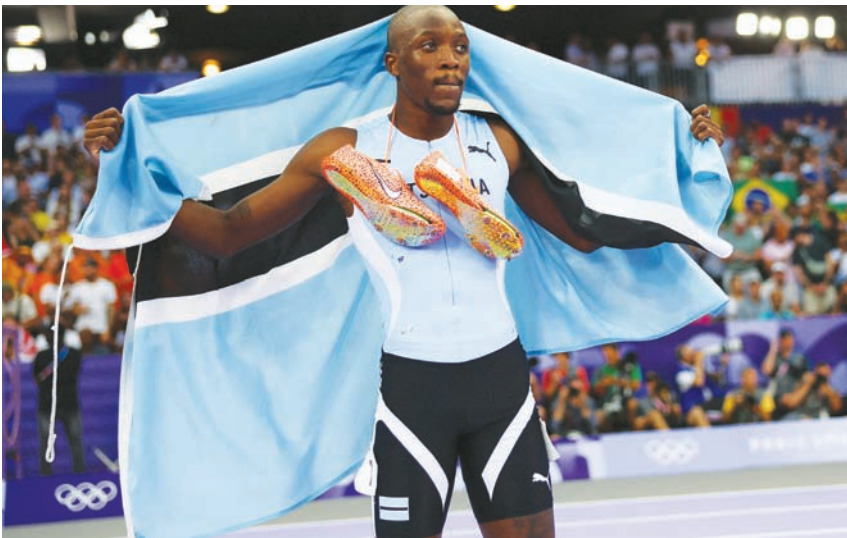
Letsile Tebogo of Botswana celebrates with his national flag after winning gold following the Men's 200m Final at the Paris 2024 Olympics on August 8, 2024.

Three-times world 200m champion Lyles had been the favourite, but moments