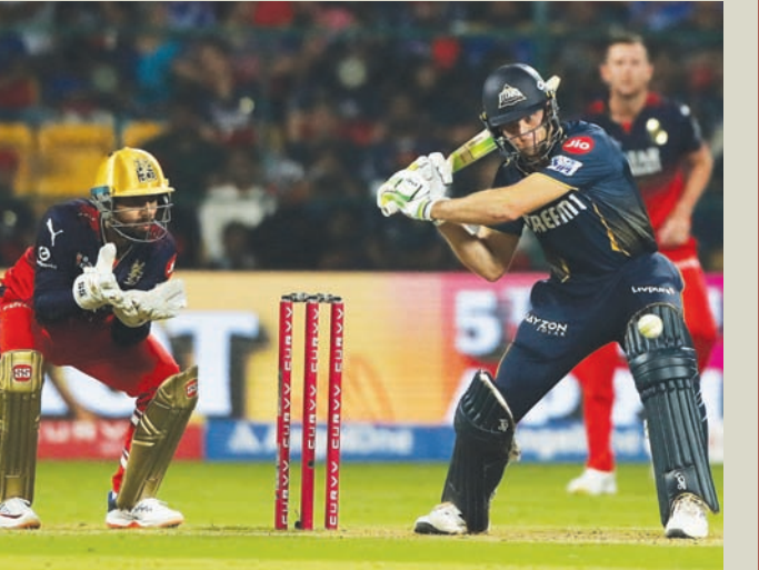
Gujarat Titans' Jos Buttler in action against Royal Challengers Bengaluru during their IPL match in M Chinnaswamy Stadium, Bengaluru, India, yesterday.

BRIEF SCORES Gujarat Titans 170 for 2 (Buttler 73*, Sudharsan 49, Rutherford 30*, Bhuvneshwar 1-23) beat Royal Challengers Bengaluru 169 for 8 (Livingstone 54, Jitesh 33, David 32, Siraj 3-19) by eight wickets