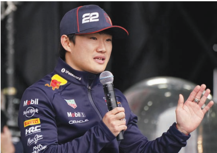
Red Bull Racing’s Japanese driver Yuki Tsunoda speaks during a talk session as part of the F1 Tokyo Fan Festival in Tokyo ahead of the Japanese Grand Prix in Suzuka.