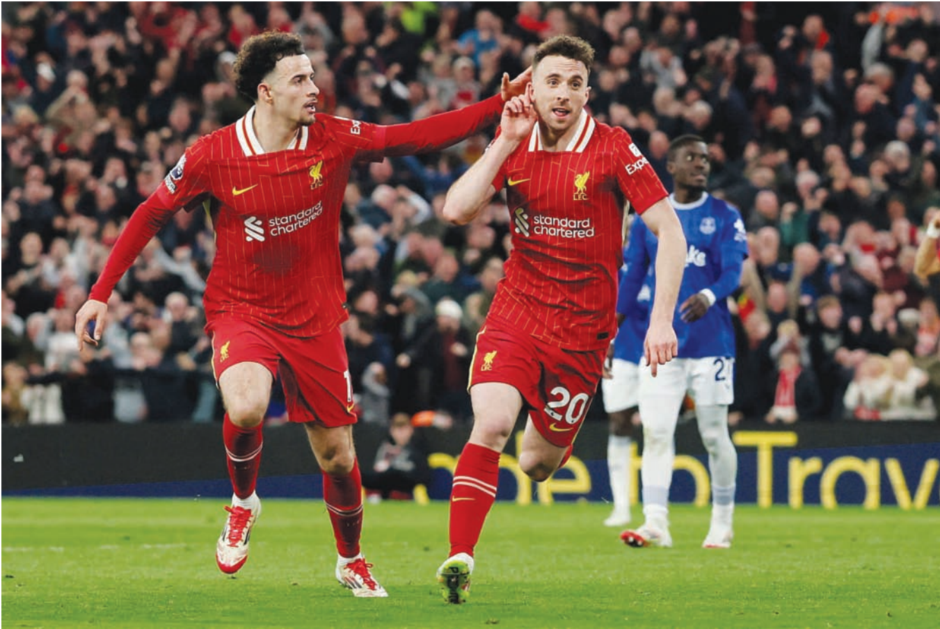
Liverpool's Diogo Jota (right) celebrates with teammate Curtis Jones after scoring a goal against Everton during the Premier League match in Liverpool yesterday.

Grealish's long-awaited goal was missed by hundreds of City fans, who stayed outside the stadium for the first nine minutes in protest at the club's deal with a third-party ticket resale