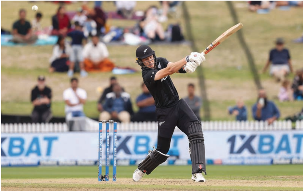
New Zealand's Mitchell Hay bats during the 2nd one day international between New Zealand and Pakistan at Seddon Park in Hamilton yesterday.

In reply, Pakistan were in early trouble when Will O'Rourke had Abdullah Shafique caught at first slip for one in the third over.