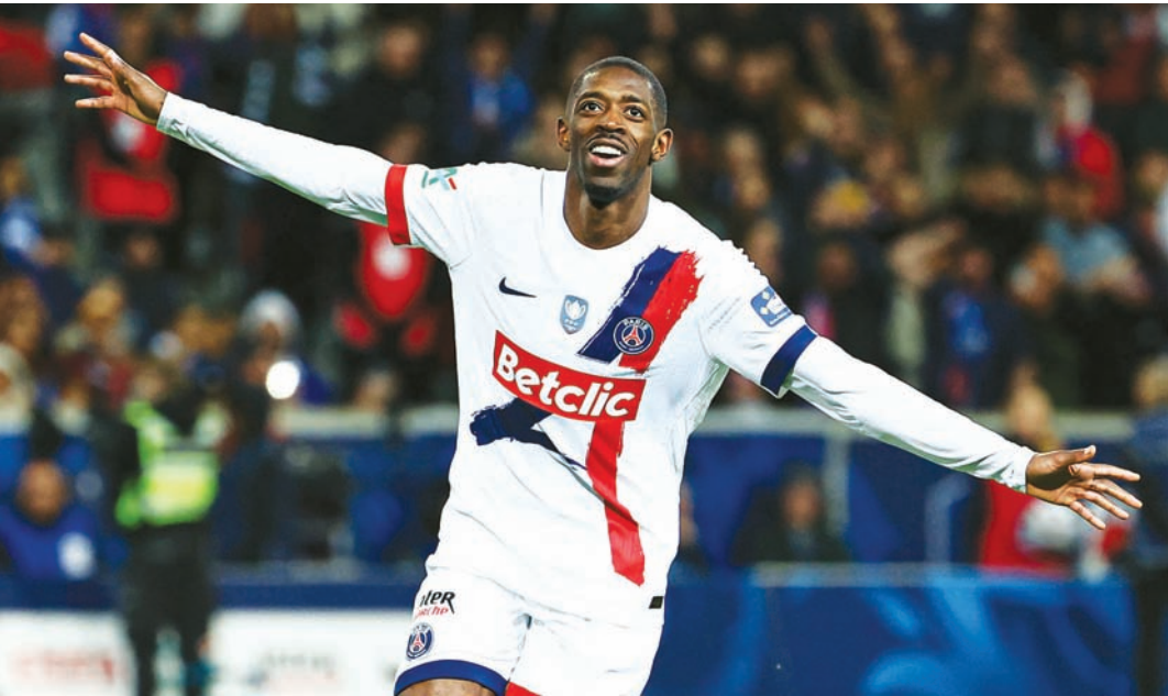
PSG's French forward Ousmane Dembele celebrates after scoring his team's fourth goal during the French Cup semi-final against USL Dunkerque at the Pierre-Mauroy stadium in Villeneuve-d'Ascq, northern France.

cut the ball back for Dembele to lash in on the stroke of half-time. They equalised three minutes after the restart when Marquinhos headed in a Dembele cross following a short corner, although Dunkerque were left furious as they felt the officials were wrong to award a corner in the first place. Naatan Skytta almost headed the second-tier side back in front moments later, but instead new France international Doue played a one-two with Bradley Barcola before scoring with a deflected shot just past the hour mark. With Dunkerque committing players forward, Dembele then burst clear to make it 4-2 deep in injury time. Luis Enrique's PSG side will be confirmed as Ligue 1 champions on Saturday if they avoid defeat at home to Angers. The Parisians then face Aston Villa next Wednesday in the first leg of their Champions League quarter-final tie.