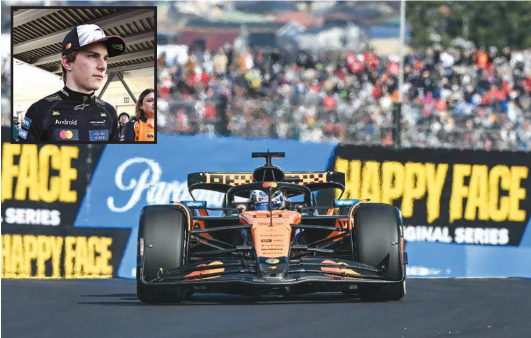
McLaren's Australian driver Oscar Piastri (also inset) drives during the second practice session of the Japanese Grand Prix at the Suzuka circuit, Mie prefecture, yesterday.

His new teammate Tsunoda was a lowly 18th, 2.511sec behind