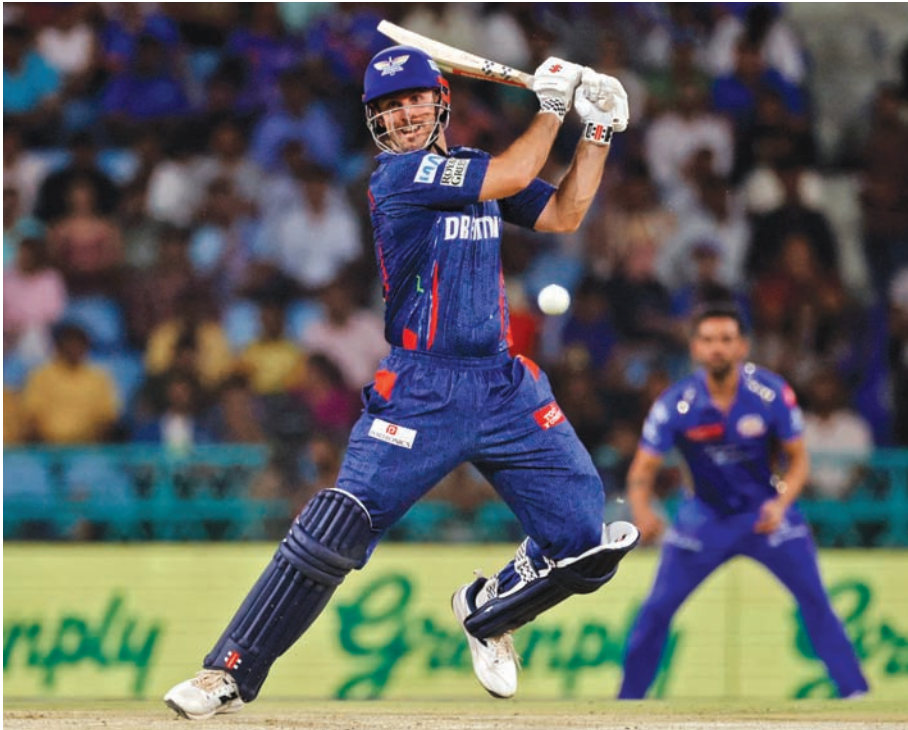
Lucknow Super Giants’ Mitchell Marsh in action against Mumbai Indians during their IPL match in Lucknow, India, yesterday.

first and soon dismissed skipper Rishabh Pant for two. Wicketkeeper-batsman Pant, who broke an IPL auction record when he went to Lucknow for a whopping $3.21mn, has flopped with the bat with scores of 0, 15 and two in the earlier matches. Markram stood firm and put together 51 runs with Ayush Badoni, who hit 30, to pull Lucknow through the middle phase before fellow South African David Miller joined the charge. Pandya kept up his bowling form as he sent