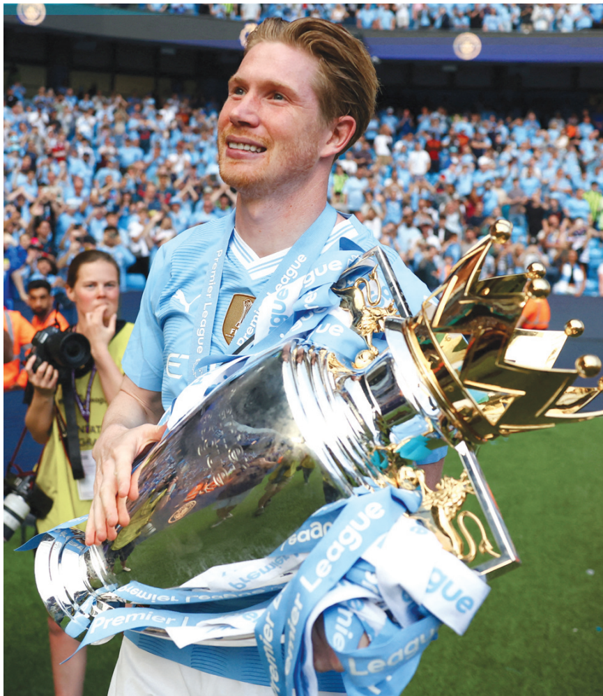
Kevin De Bruyne has won 14 major trophies since joining Manchester City from Wolfsburg in 2015, including six Premier League titles and the Champions League in 2023.

This season he has made just 21 starts in City's 47 matches in all competitions despite the struggles of Guardiola's side to match the standards they have set over the past decade. City sit fifth in the Premier League, 22 points behind leaders Liverpool, and were comfortably beaten 6-3 on ag-