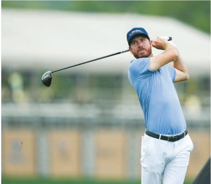
Sam Ryder watches his tee shot on the eleventh hole during the second round of the Valero Texas Open golf tournament.

he pitched onto the green and sank a 12-foot birdie putt. Spieth, a Texas native, won this event in 2021 and is looking for his first win on tour in almost three years. He has had a fine start to the season after recovering from off-season wrist surgery. “It’s been a little bit of a mixed bag, but I’ve had way more (positive) days than I have in the last couple years, really since May of ‘23 when I first injured my wrist,” Spieth said. Other notable players like Spieth who are tuning up for next week’s major include Englishman Tommy Fleetwood (68), Sam Burns and Tony Finau (69) and Patrick Cantlay, Keegan Bradley and Swede Ludvig Aberg (71). Rickie Fowler (75), Max Homa (76), Englishman Matt Fitzpatrick (76) and South Korea’s Tom Kim (77) are in danger of missing the 36-hole cut. Defending champion Akshay Bhatia opened with a 74.