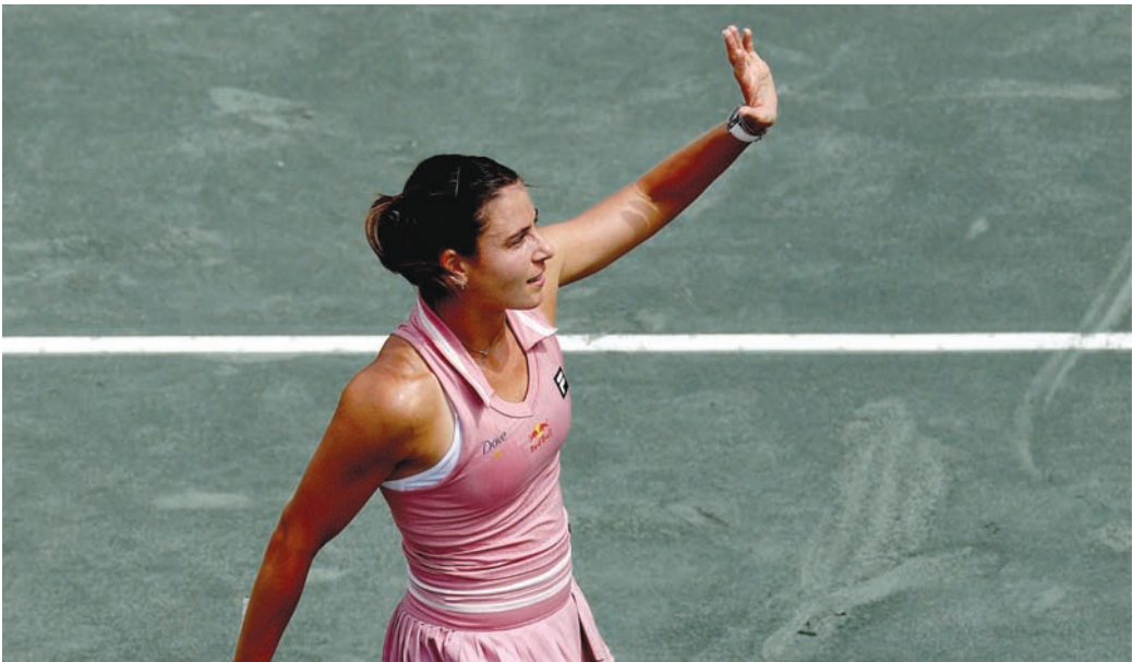
Emma Navarro of United States celebrates her win against Hailey Baptiste of United States during the Credit One Charleston Open at Credit One Stadium in Charleston, South Carolina.

"We have responded by proposing a direct, open and constructive meeting at the Madrid Open, at Roland-Garros, or at any other suitable time," the statement said.