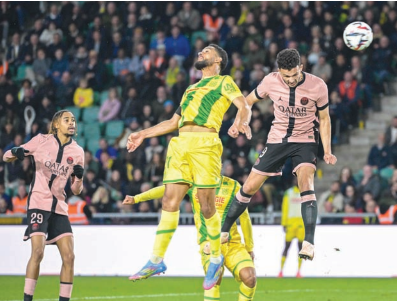
Nantes' Jean-Charles Castelletto and Paris Saint-Germain's Goncalo Ramos (right) fight for the ball in Nantes, western France.