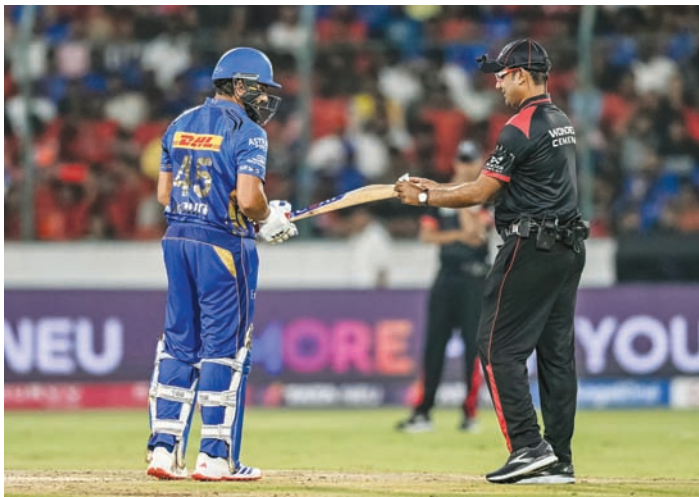
A field umpire (right) checks the bat of Mumbai Indians' Rohit Sharma during the IPL match against Sunrisers Hyderabad in Hyderabad yesterday. Mumbai Indians won by seven wickets.