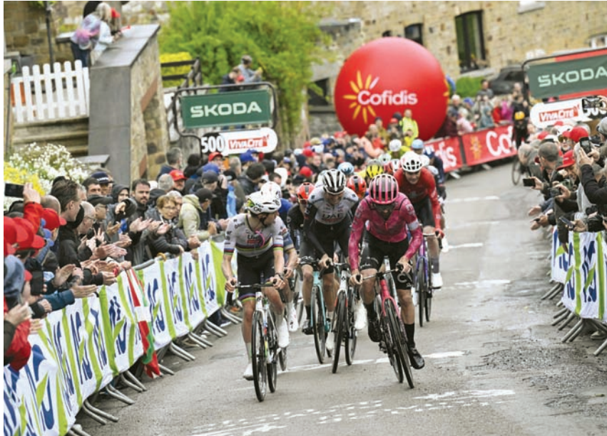
UAE Team Emirates' Slovenian rider Tadej Pogacar (left) and Team EF Education's Irish rider Ben Healy (right) compete during the men's "La Fleche Wallonne" one day cycling race (Waalse Pijl - Walloon Arrow), 205.2kms from Ciney to Huy yesterday.

erated and when I looked over my shoulder, no one was there. But really that's the hardest kilometre in cycling," he added. This was a return to winning ways for Slovenian Pogacar after his second-placed finish to Mathieu van der Poel at Paris-Roubaix, and another second place in the Amstel Gold race behind Mattias Skjelmose on Sunday. Skjelmose had been highly fancied again here but the 24-year-old was one of several riders who slid out of the race on a slick corner around 40km from home on a day of unrelenting rain. His Lidl teammate Thibau Nys had also been touted as a man who could beat Pogacar on the final climb but eventually came eighth, perhaps due to the fact Skjelmose had dropped out. A stubborn escape group clung on until the final ascent, in a sign of how little appetite there was for a long-range bid for glory from one of the race favourites. Many of yesterday's competitors will be back in action Sunday in the same corner of the Ardennes for the Liege-Bastogne-Liege 'Monument' over 252km where an escape is more likely.