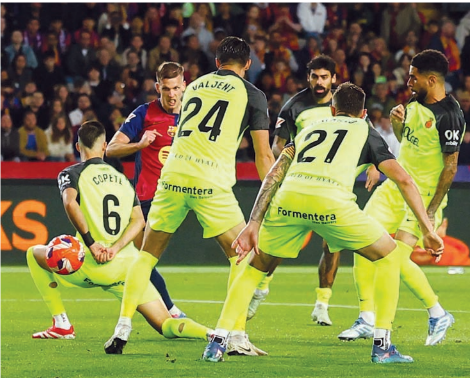
Barcelona's Dani Olmo (second left) scores during the La Liga match against Mallorca at the Estadi Olimpic Lluis Companys Stadium in Barcelona on Tuesday.

On Tuesday, Barca dominated proceedings despite coach Flick deciding to rest several key starters, but Mallorca goalkeeper Leo Roman