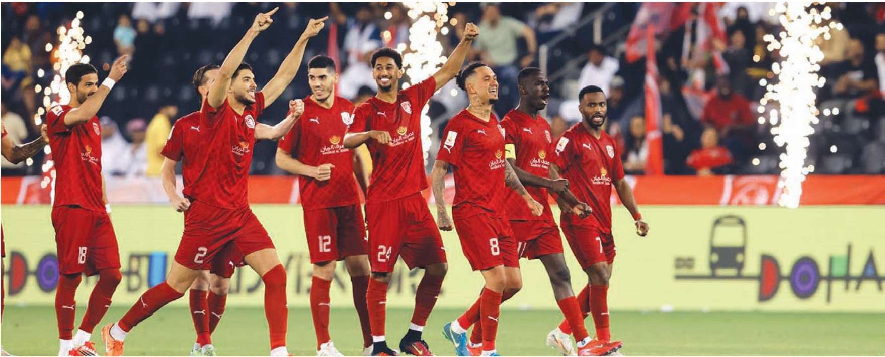
Al Duhail players celebrate after their win over Al Gharafa in the Qatar Cup semi-final at Jassim Bin Hamad Stadium yesterday.

The Red Knights will now face bitter rivals Al Sadd in the final on May 10