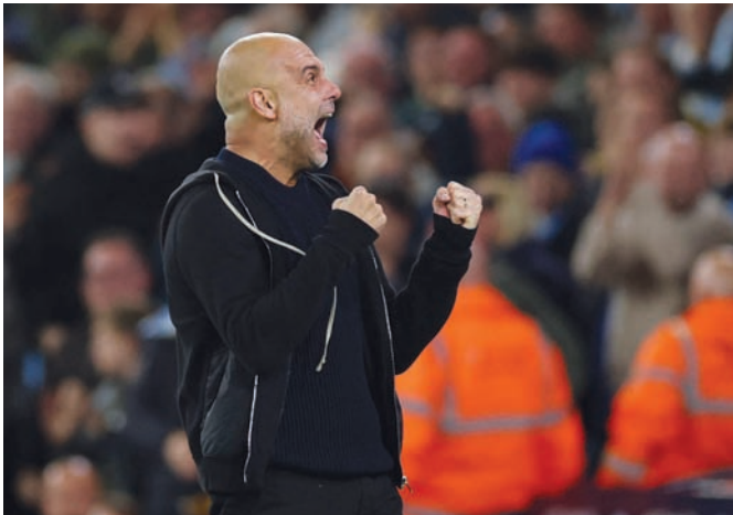
Manchester City manager Pep Guardiola celebrates after his team's win over Aston Villa in the Premier League on Tuesday.

De Bruyne, who said on Sunday that he was surprised not to be offered a new contract by the club, did not bother to walk around to City's dugout when he was substituted for Manuel Akanji late in Tuesday's game, instead perching on the advertising board and offering instructions to his teammates.