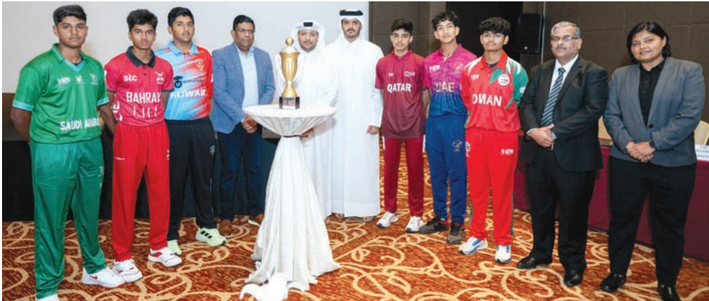
Participating team captains and officials pose with the trophy during the draw ceremony of the ACC Men's U16 West Zone Cup - Qatar 2025 tournament in Doha.