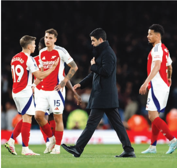
Second-placed Arsenal are 12 points adrift of Liverpool, and with only four matches left for the north Londoners, Arne Slot's team will seal the title if they avoid defeat against Tottenham at Anfield on Sunday. (Reuters)

"It was not our goal to decide the title, it was our goal to win the game. A draw is a very good result. More important is the performance. We are back on the track," Glasner said.