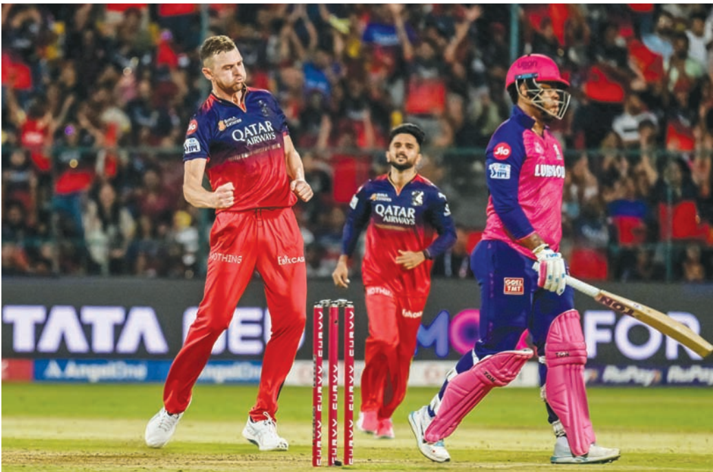
Royal Challengers Bengaluru's Josh Hazlewood (left) celebrates after taking the wicket of Rajasthan Royals' Shimron Hetmyer (right) during the IPL match in Bengaluru yesterday.

out bowler and finished with 33-1. Sandeep Sharma took 2-45 and Sri Lanka's Wanindu Hasaranga finished with 1-30.