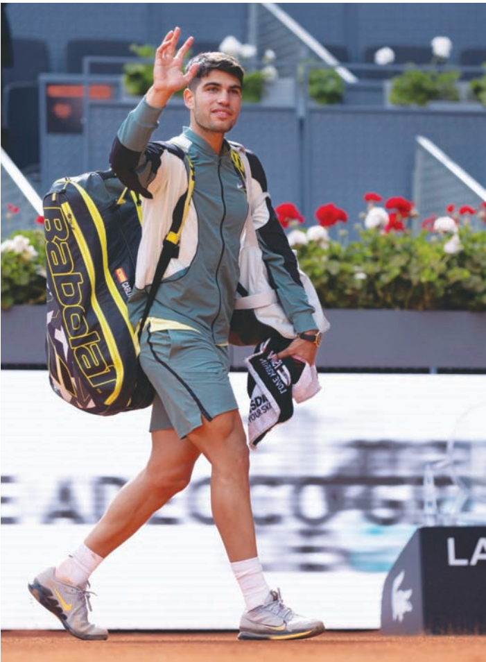
Carlos Alcaraz walks off the court following a training session ahead of his first match at the Madrid Open. Alcaraz yesterday pulled out of the tournament citing an injury.

ally far in Monte Carlo but it was also the first year I lost in the first match in Miami, so I had time to prepare for the clay season,” Alcaraz said.