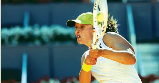
Poland's Iga Swiatek in action during her round of 64 match against Philippines' Alexandra Eala at the Madrid Open yesterday.

Swiatek will face Czech Linda Noskova in the third round. In other matches, Anastasija Sevastova ousted 2017 French Open winner and Latvian compatriot Jelena Ostapenko 7-6 (7/2), 6-2. Ostapenko beat Swiatek in the Stuttgart quarter-finals last week.