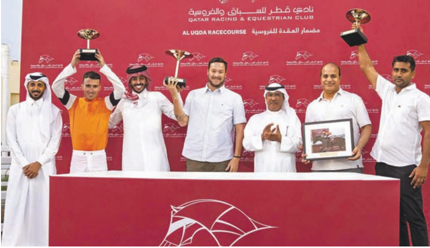
Connections of Kerindia celebrate with the trophies at Al Uqda Racecourse yesterday.

It was also a double on the day for Patel, who earlier steered Pearling Path to success in the Thoroughbred Handicap 70-90 (Class 3).