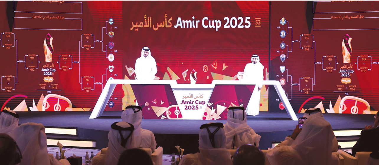
The draw for the round of 16 matches for the 53rd edition of the Amir Cup was held yesterday.