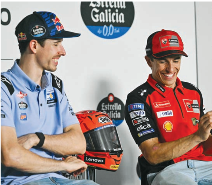
Team Gresini Racing MotoGP’s Alex Marquez (left) laughs with his brother Team Ducati Lenovo Team’s Marc Marquez during a press conference ahead of the MotoGP Spanish Grand Prix at the Jerez racetrack in Jerez de la Frontera yesterday.

“We cannot forget Pecco (Bagnaia) won the last three years there