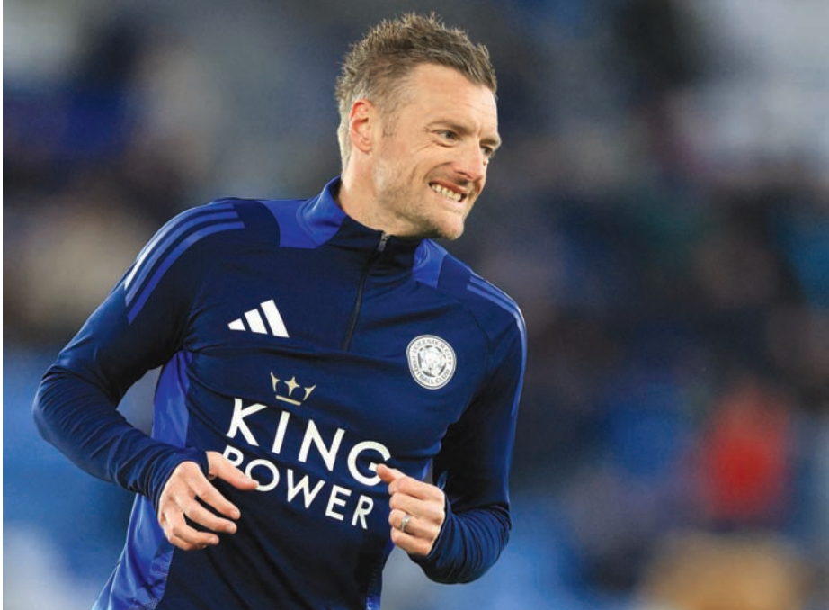
Jamie Vardy joined Leicester's in 2012 from non-league side Fleetwood for just £1mn and has scored 198 goals in nearly 500 appearances.

Ruud van Nistelrooy's side are 19th in the table, having collected just 18 points from their 33 matches and are heading back to the Cham-