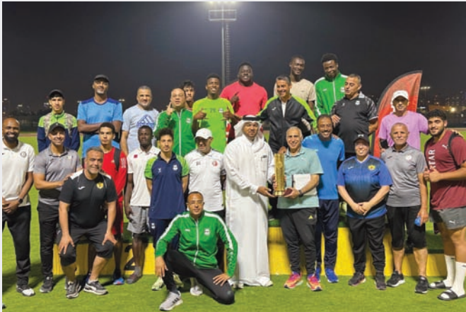
Al Ahli SC clinched the Amir Cup Athletics Championship title triumphing over eight other participating clubs: Al Sadd, Al Gharafa, Al Rayyan, Al Arabi, Al Shamal, Qatar, Al Wakrah and Al Khor. Held at the Al Rayyan field and track, this championship is a significant event for the Qatar Athletics Federation. Al Ahli demonstrated remarkable prowess in both track and field events, amassing 163 points. This impressive score placed them comfortably ahead of Al Arabi, who secured second place with 150 points. Al Sadd claimed the third position with 98 points. The subsequent rankings were Al Qatar (71 points), Al Khor (65), Al Rayyan and Al Khor (both with 65), Al Wakrah (55), Al Gharafa (49), and Al Shamal (39).